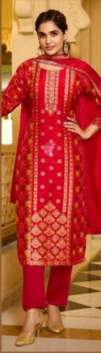
DASTOR VOL.4 3871