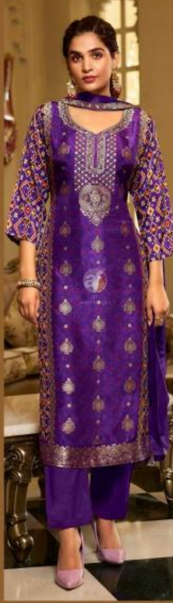
DASTOR VOL.4 3872