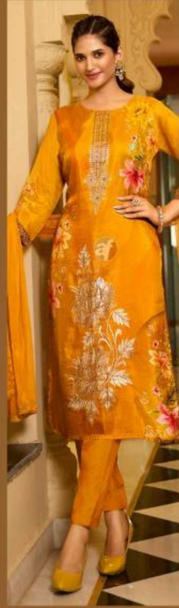
DASTOR VOL.4 3873