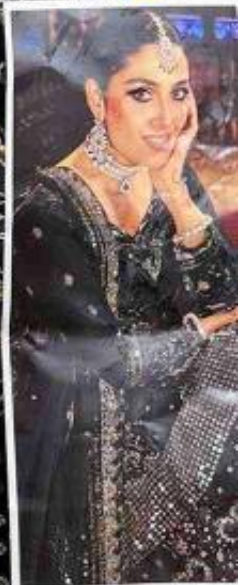
CHANTELLE Z Vol. 11 TOP Butterfly net with Gold BOTTOM PINK Dull Satin DUPATTA Butterfly net with Gold