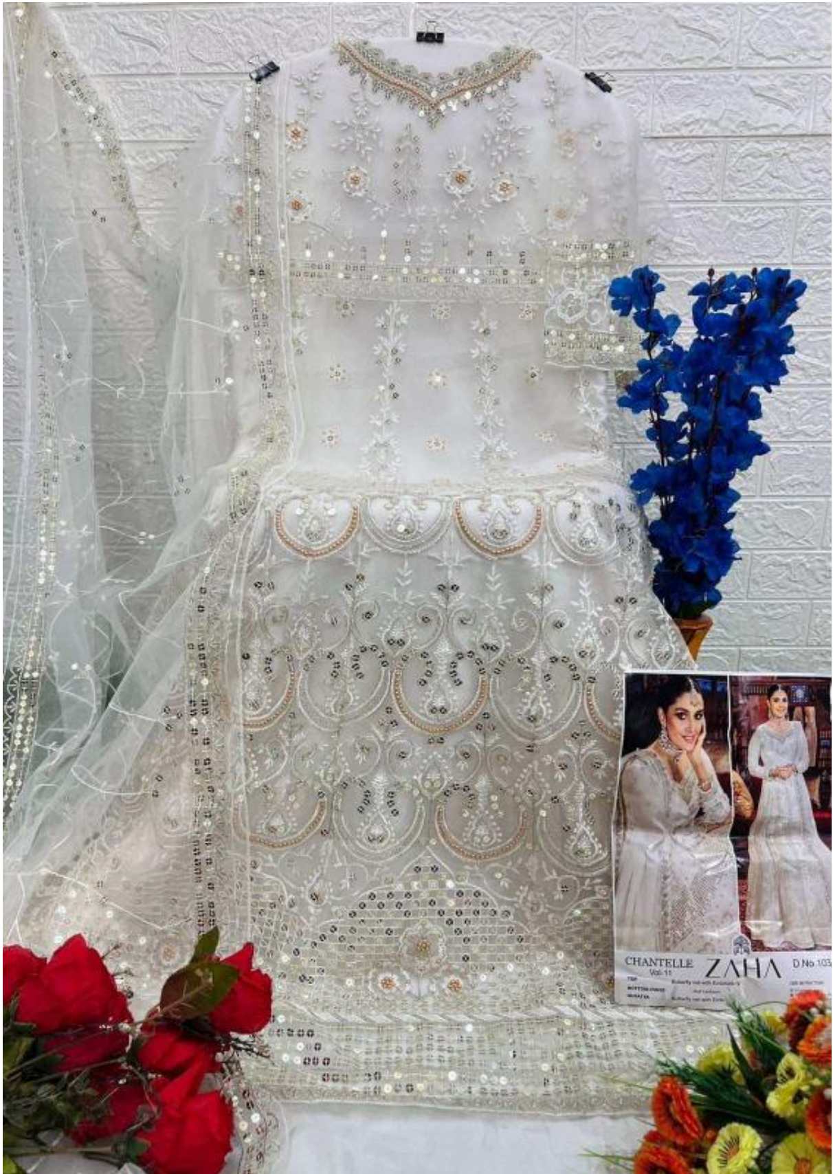
CHANTELLE ZAHA D No. 103 Vol. 11 THE BODY is not with Bustline. BOTTOM PART is not with Bustline. MAKE UP is not with Bustline.