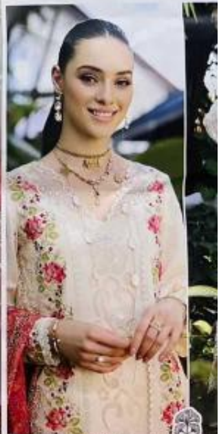
ADAN LIBAS (LAWN COLLECTION) VOL-1 ZAH TOP - Cambric Cotton With Heavy Embroidery Work BOTTOM-INNER Set