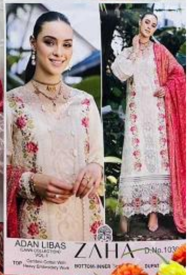
ADAN LIBAS LAWA COLLECTION PC-11 TOP: Cotton, Cotton Viscose Heavy Embroidery Work ZAHA D-No.1038 BOTTOM: RINGED SILK