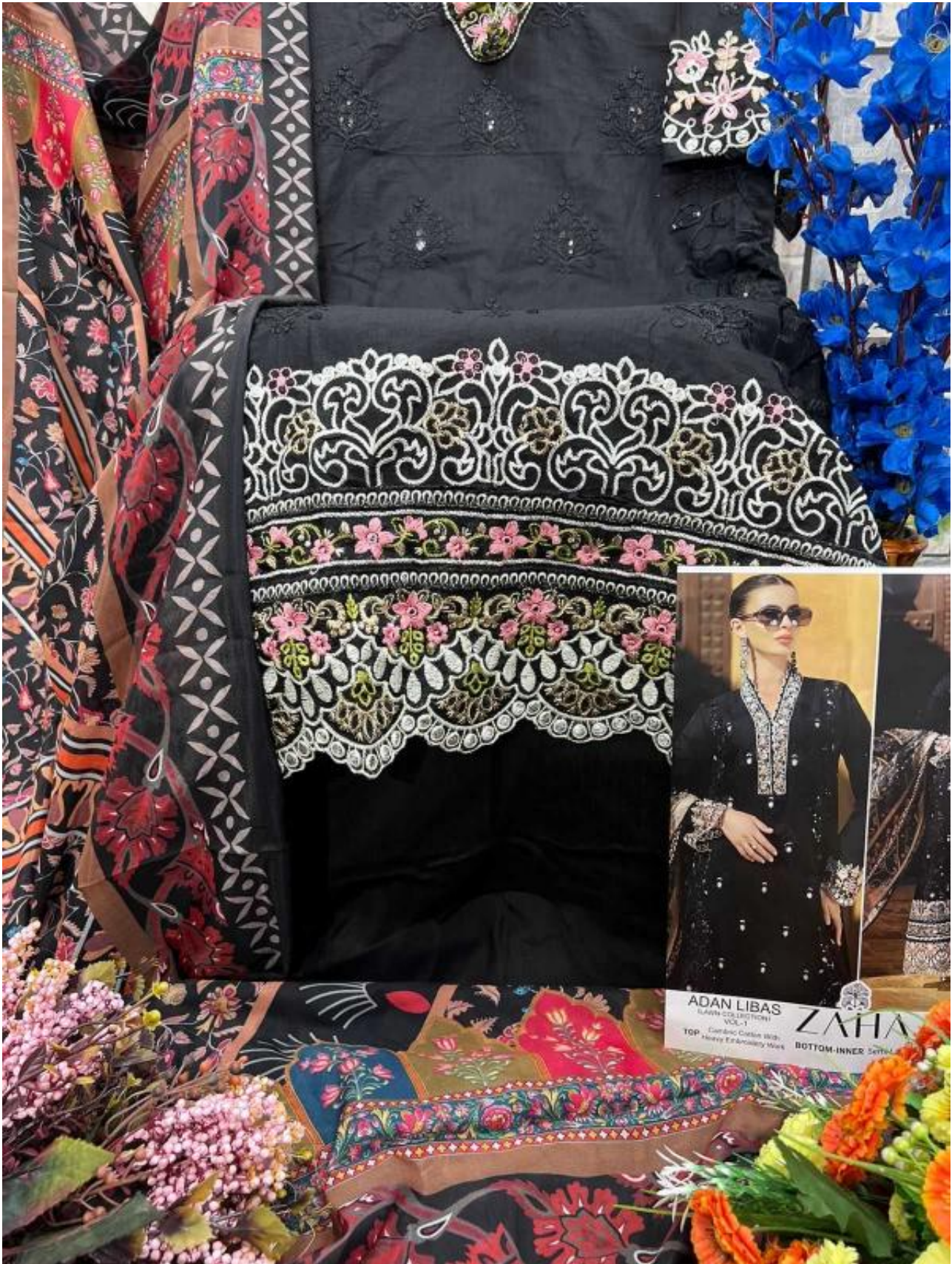
ADAN LIBAS LAWA COLLECTION VOL-1 TOP - Curious Cotton With Heavy Embroidery Work BOTTOM-INNER SETTING ZAHHA