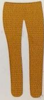
(4) D. BUFF