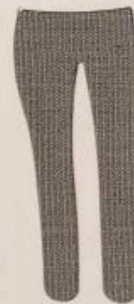
(26) DT. GREY