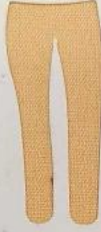
(5) L. BUFF