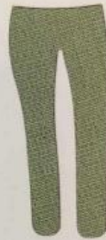
(25) OLIVE GREEN