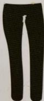
(29) B. GREEN