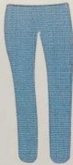
(23) DT. SKY