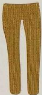
(27) DT. CEMENT