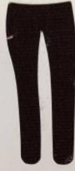
(6) N. BLUE