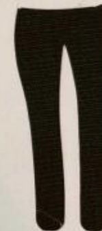
(32) DARK GREEN