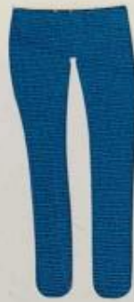
(24) DT. BLUE