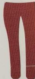
(31) ONION PINK