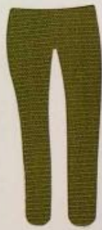
(22) DT. GREEN