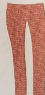
(20) DT. ROSE