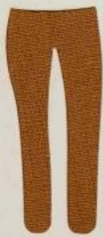
(21) DT. BISCUIT