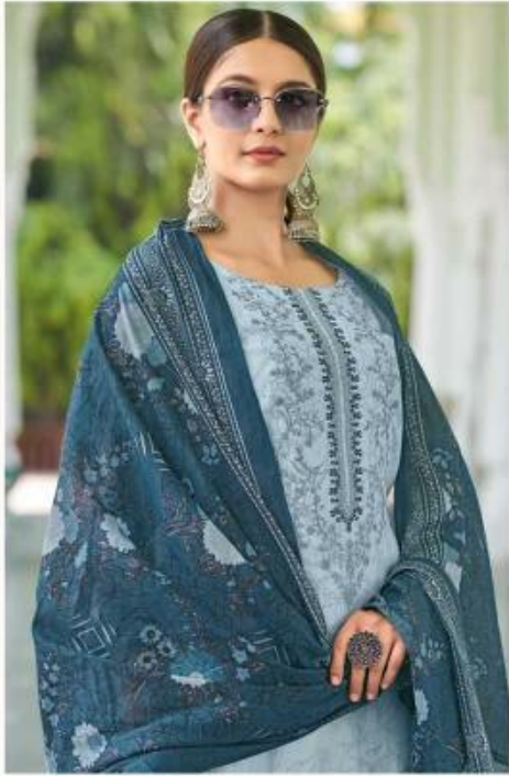
"Culture's Dance, Quality's Grace. Dresses that Beautifully Embrace."