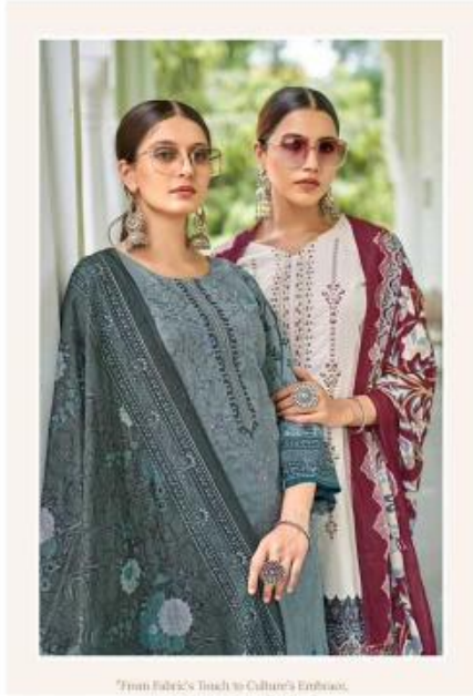
"From India's Touch to Culture's Embroid, Dresses Woven in Quality Lace."