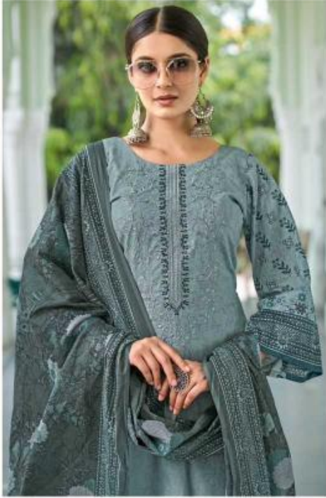
"Fabrics of Grace, Dresses that Embrace - Unveiling Your Radiant Culture."