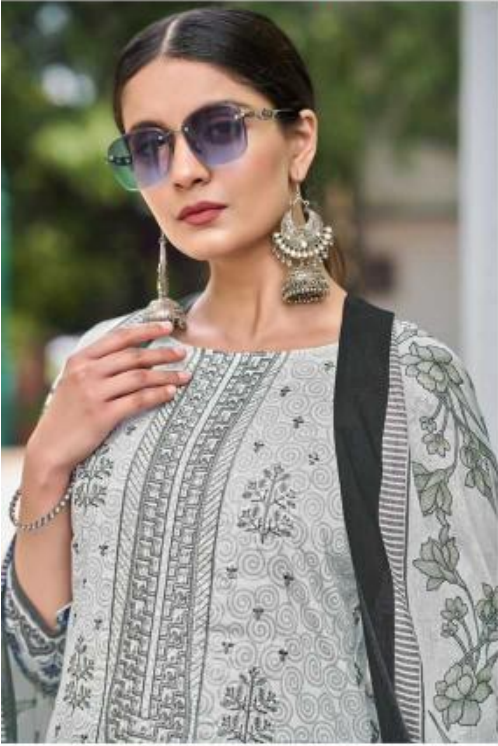
"Cultural Elegance, Quality's Bloom, Dresses that Exude Beauty & Style."