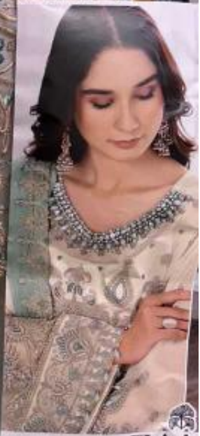
ZAH TOP Pkx Georgette with Embroidery (Cat 2 & 3 Mr) BOTTOM-INNER