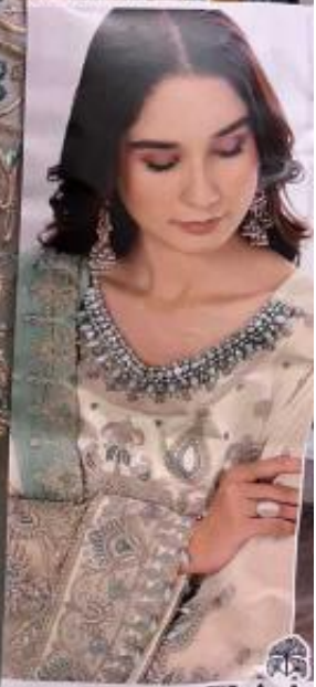
ZAH TOP PINK Georgette with Embroidery (Cat 2 & Mir) BOTTOM-INNER