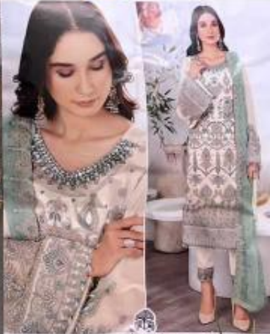
ZAHA Lila 10226 TOP: Faux Georgette with Embroidery (Cut 2.5 ft) BOTTOM: INVISI Duff Lingerie (Cut 4.25 m)