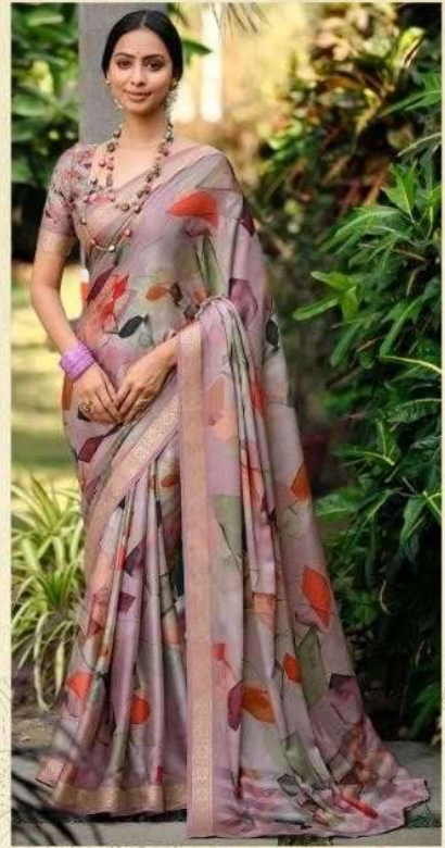
DN /// 1003