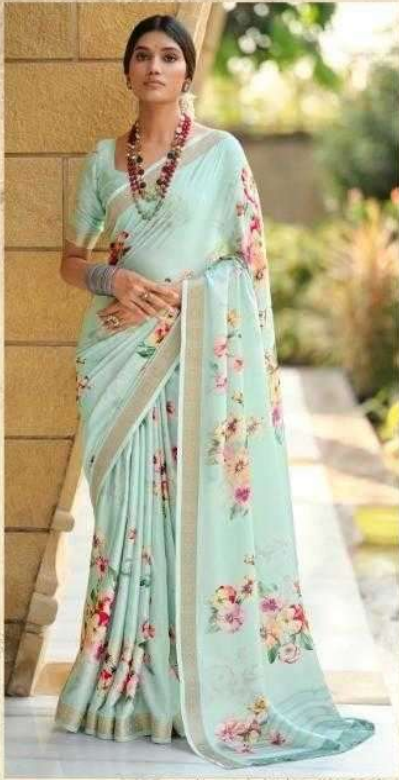
DN /// 1001