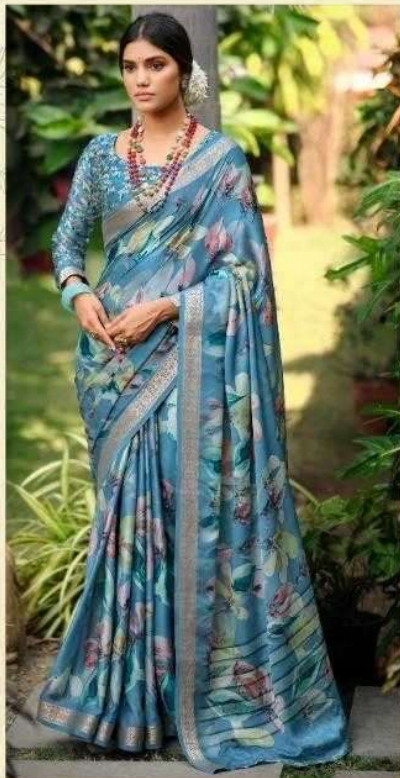
DN /// 1009