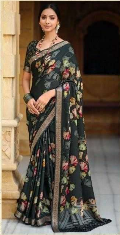
DN /// 1002