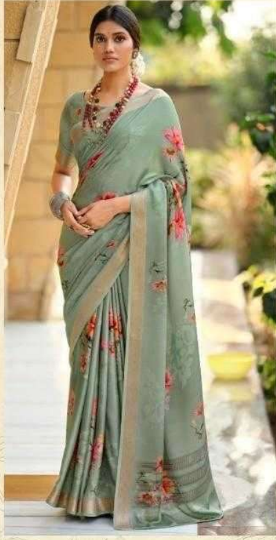
DN /// 1004