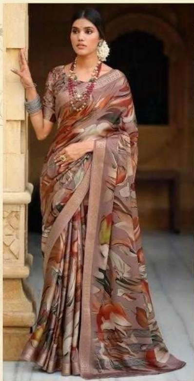
DN /// 1006