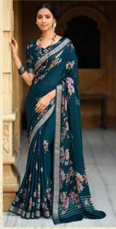
DN /// 1005