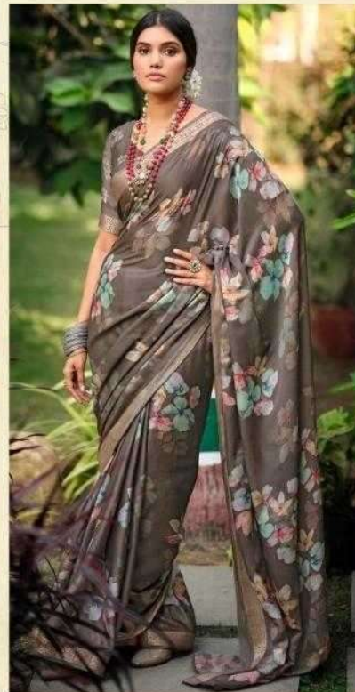
DN /// 1010