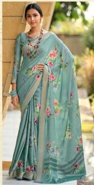
DN /// 1007