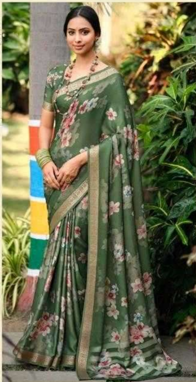
DN /// 1008