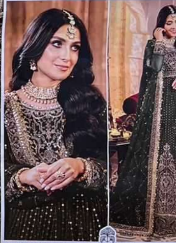
CHANTELLE ZAHA D.No.1 Vol-10 TOP Butterfly net with Embroidery BOTTOM INNER Full Sarban DUPATTA Butterfly net with Embroidery