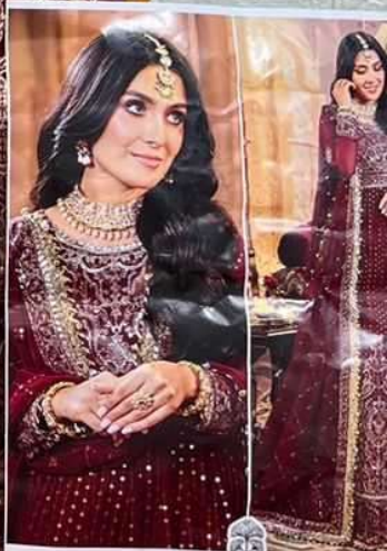
CHANTELLE ZAHA D.NC Vol-10 TOP Butterfly net with Embroidery BOTTOM INNER Dull Satton DUPATTA Butterfly net with Embroidery