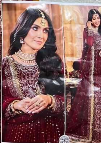
CHANTELLE ZAHA D.NC Vol-10 TOP Butterfly net with Embroidery BOTTOM INNER Dull Satton DUPATTA Butterfly net with Embroidery