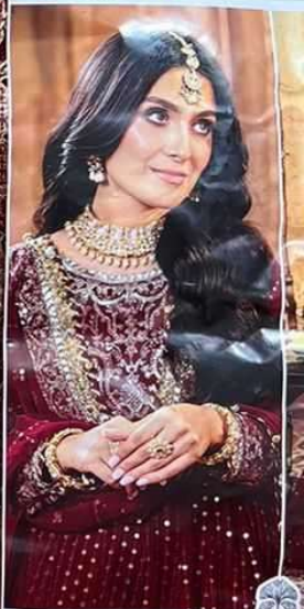
CHANTELLE ZAH Vol-10 TOP Butterfly net with Embroidery BOTTOM INNER Dui Samoon DUPATTA Butterfly net with Embroidery