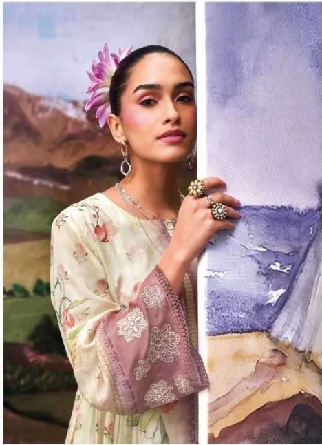
A great photograph is one that fully expresses what one feels, in the deepest sense, about what is being photographed.