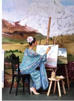
A great photograph is one that fully expresses what one feels in the deepest sense about what is being photographed.