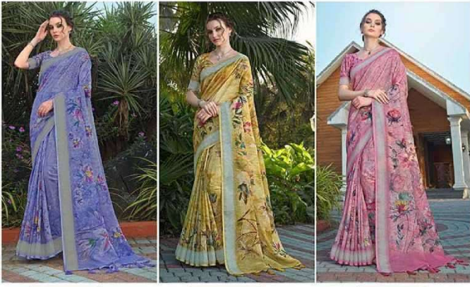
❖ 24231 ❖