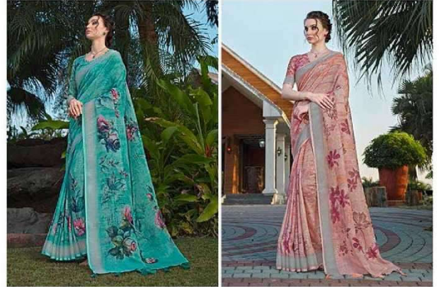
❖ 24238 ❖