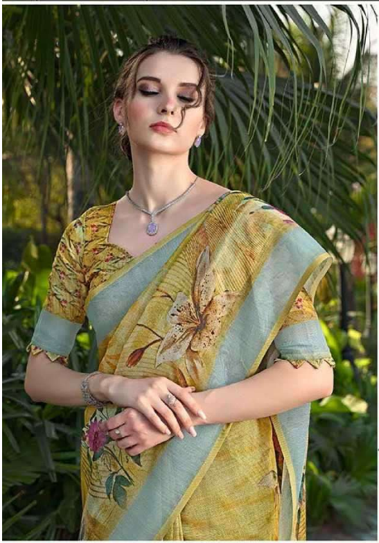
"Gorgeous Sarees, Woven Fabrics: Adorable Beauty Embodied in Simply Fabulous Elegance."