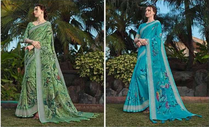
❖ 24234 ❖