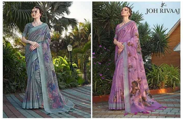
❖ 24236 ❖