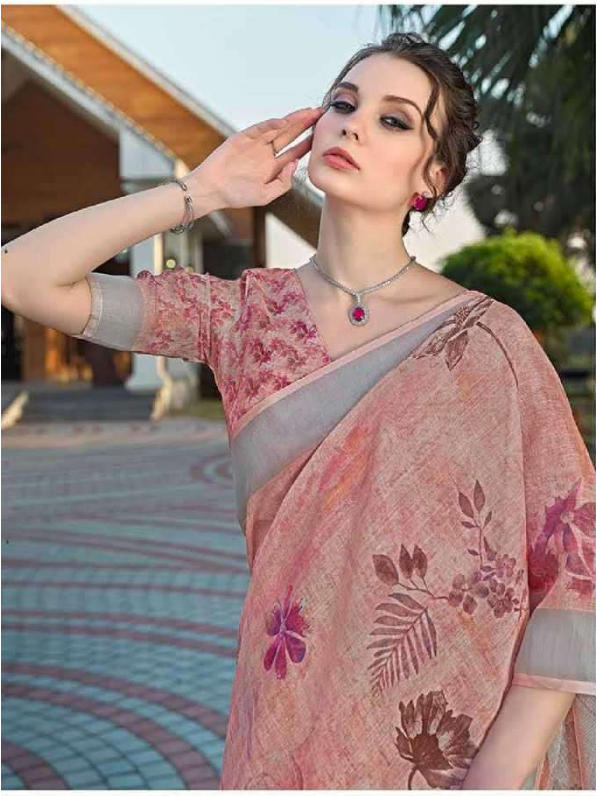
"Saree Princess: Where Adorable Fabrics Meet Simply Gorgeous Beauty in a Symphony of Fabulous Elegance."