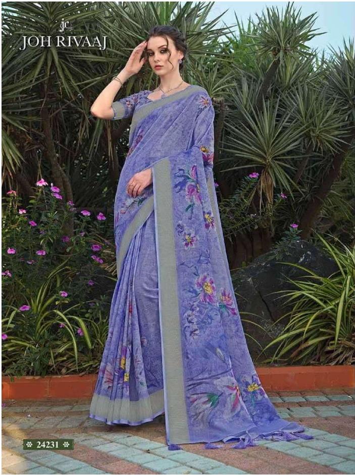
"Saree Symphony: Fabulous Fabrics Weave Tales of Adorable Beauty and Timeless Gorgeoussness."