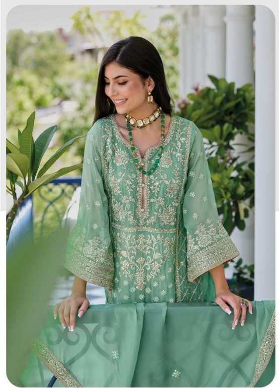
FALL Of grace 1594