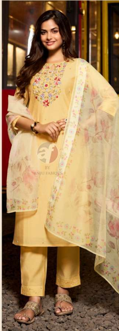
Chandani VOL-3 D.no.3732