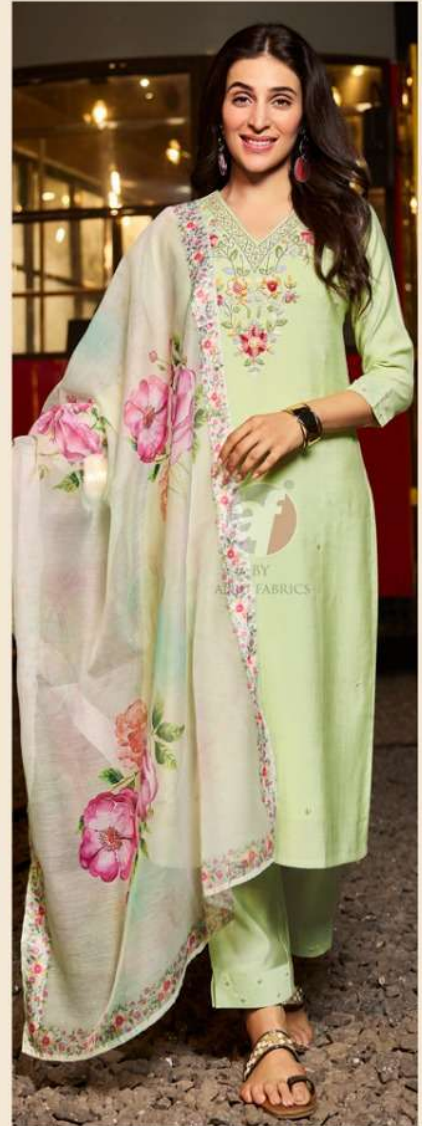
Chandani VOL-3 D.no.3736