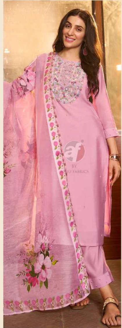
Chandani VOL-3 D.no.3733