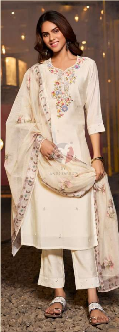
Chandani VOL-3 D.no.3734