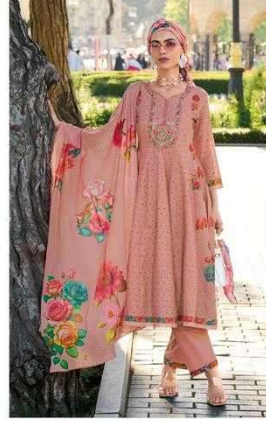
✧ 42715 ✧