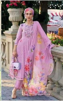
✧ 42714 ✧