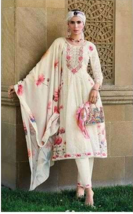
✧ 42711 ✧