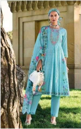
✧ 42713 ✧