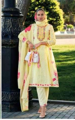
✧ 42712 ✧