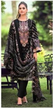
MUSAFIR VOL-10 10001