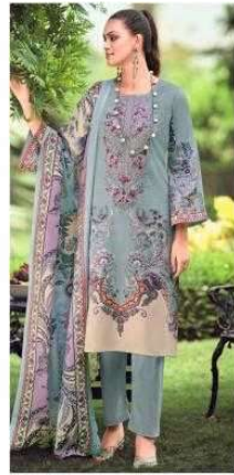
MUSAFIR VOL-10 10004