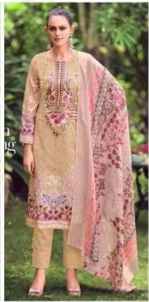
MUSAFIR VOL-10 10006