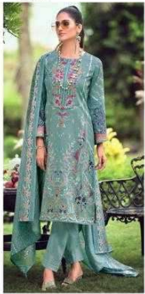
MUSAFIR VOL-10 10005