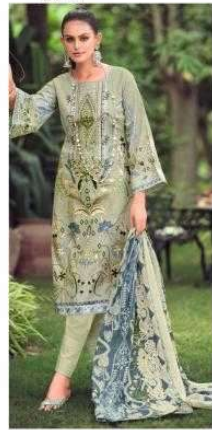
MUSAFIR VOL-10 10008