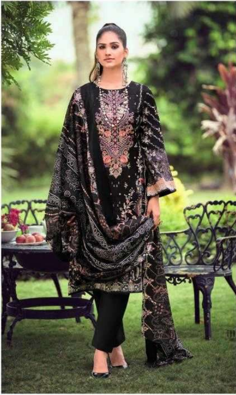
A blend of colors that highlight every corner of the attractive designs that in turn adorn you with vast beauty.