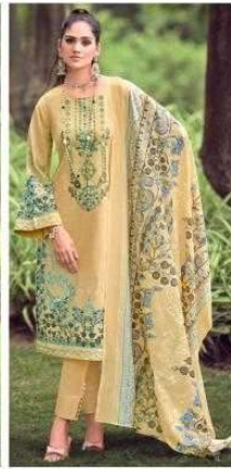
MUSAFIR VOL-10 10003