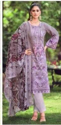
MUSAFIR VOL-10 10007