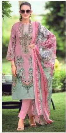
MUSAFIR VOL-10 10002