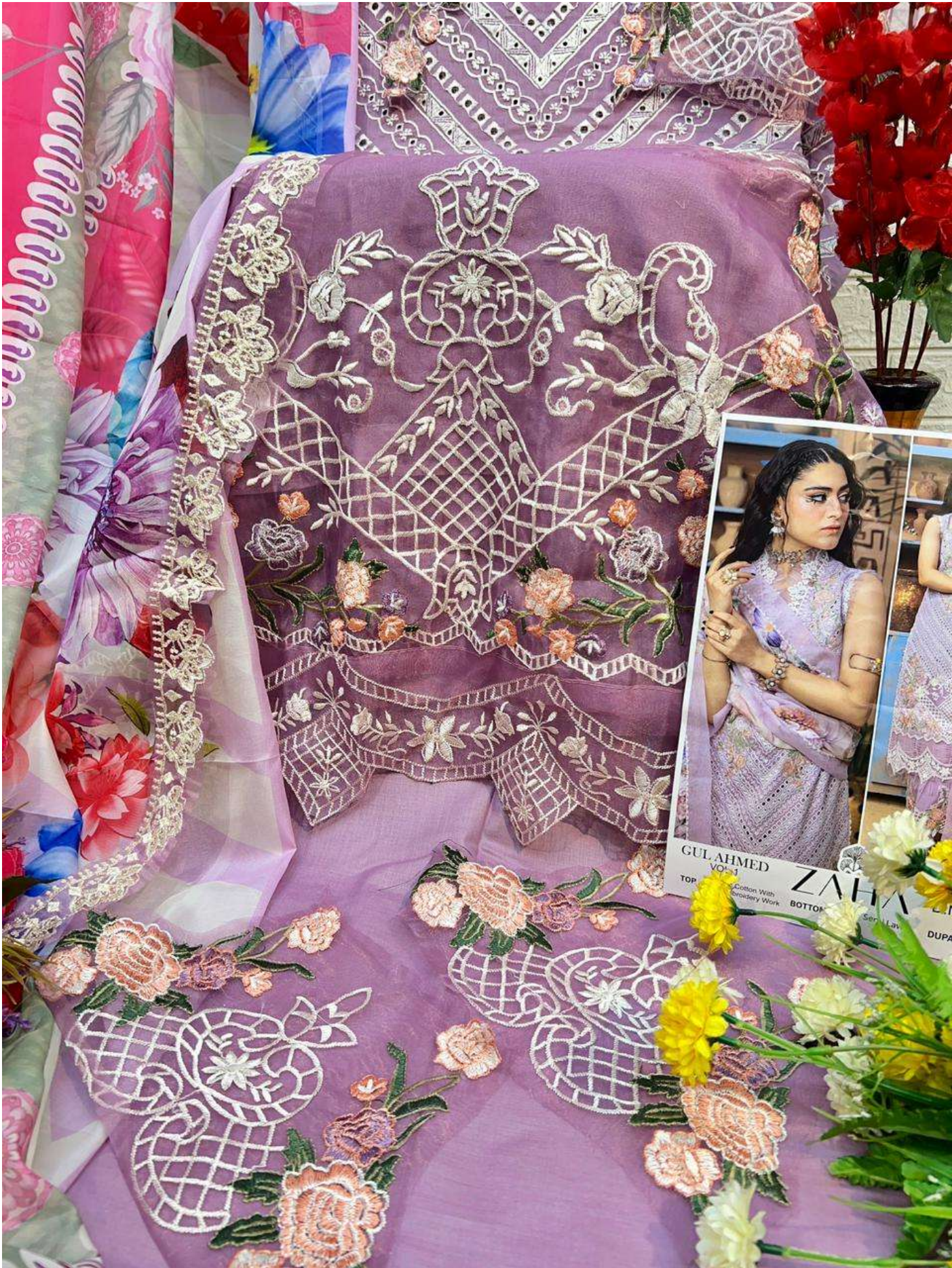
GUL AHMED VOL 1 TOP Cotton With Embroidery Work ZAHARA BOTTOM Serai Lav DUPA