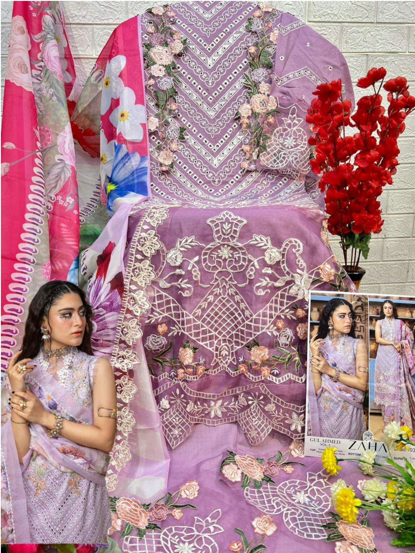
GUL AHMED VOL-1 TOP: Cami with heavy work BOTTOM: Dupatta with heavy work ZAHA L No. 03