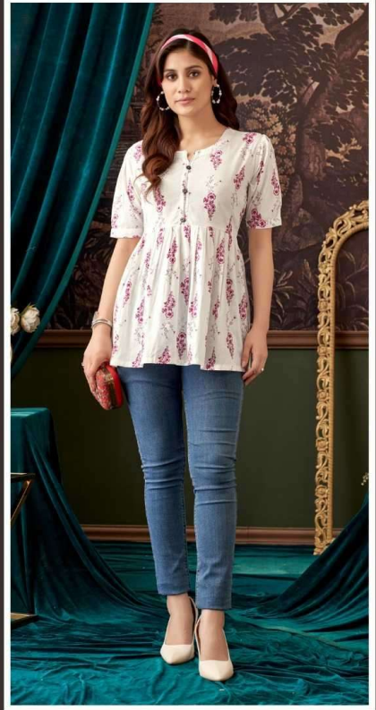
D No. 1003