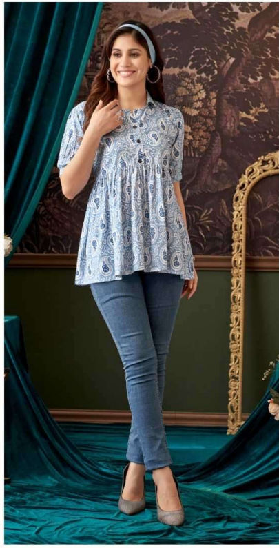
D No. 1001