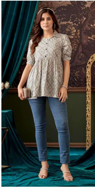
D No. 1002