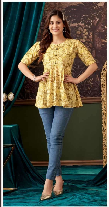
D No. 1005