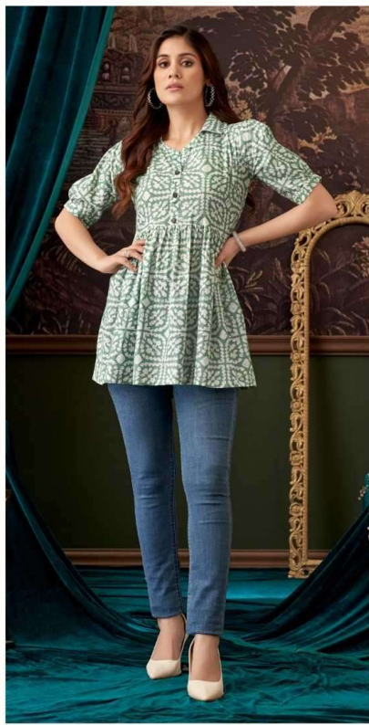
D No. 1004