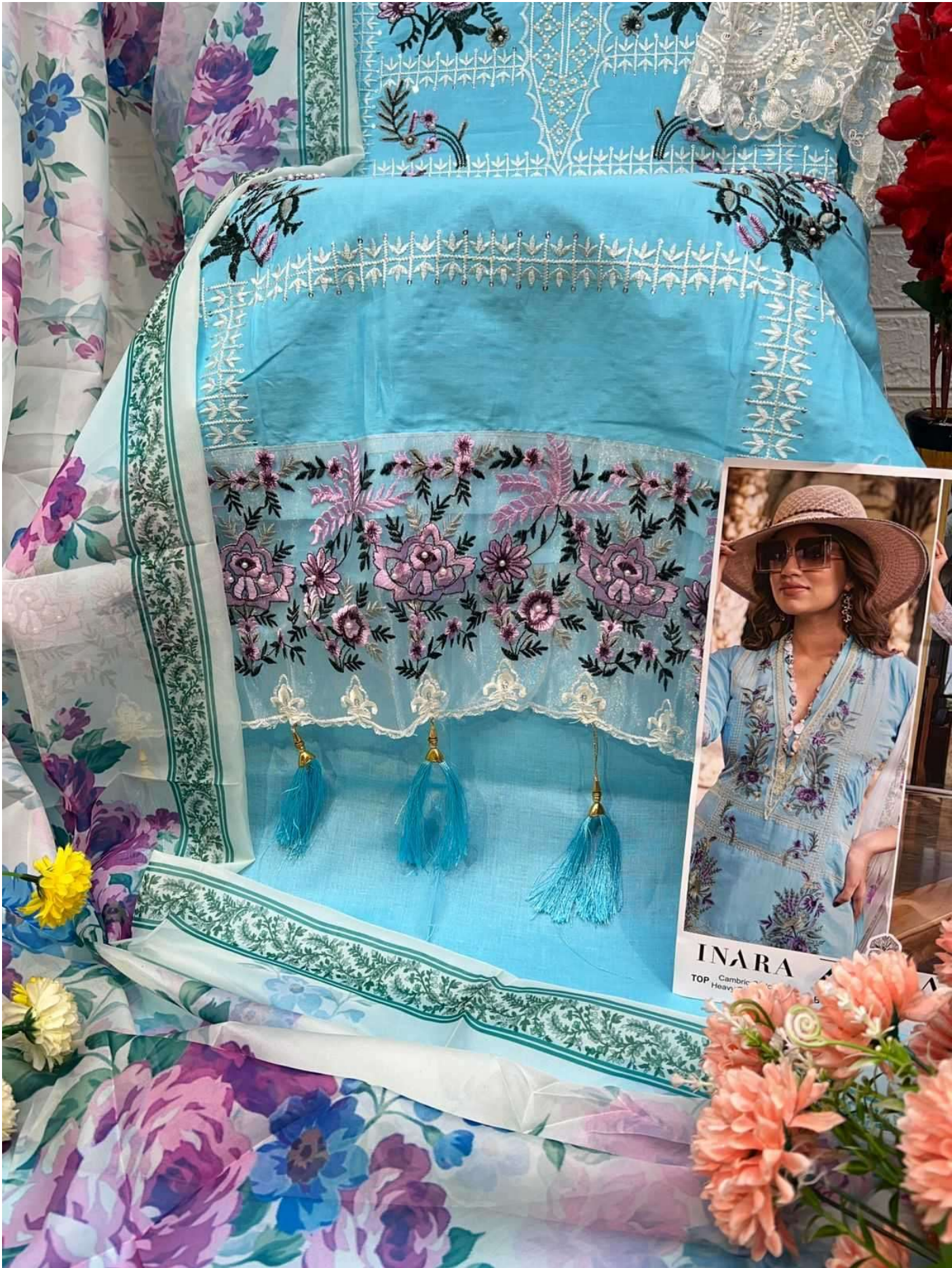
INARA TOP Cambric Heavy