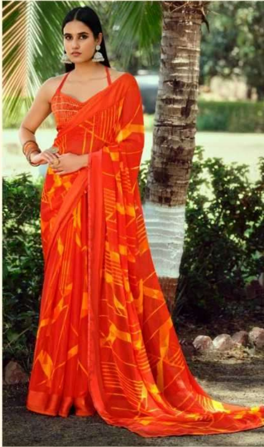
{ 1001 }