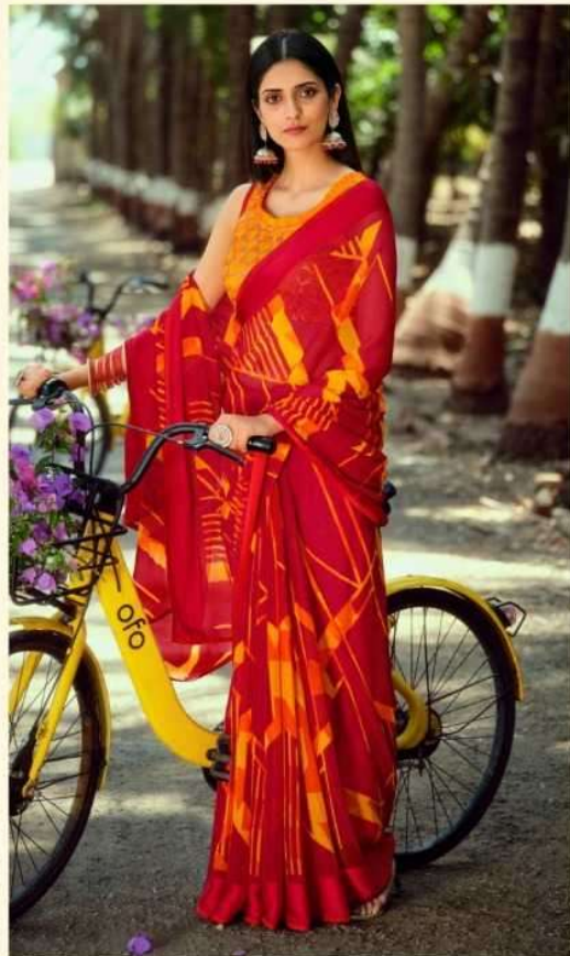
{ 1004 }