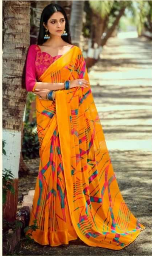
{ 1002 }