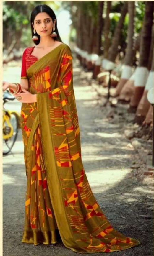
{ 1008 }