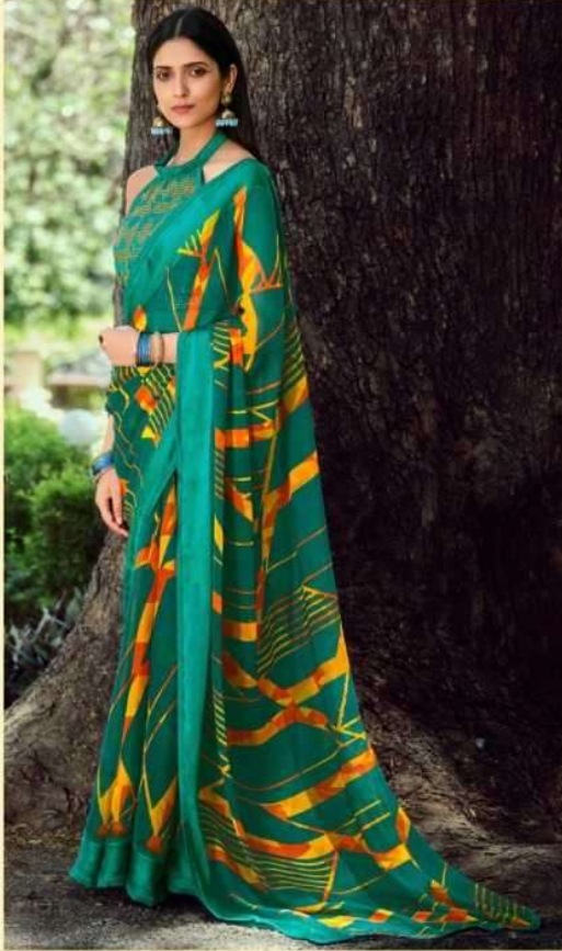
{ 1005 }