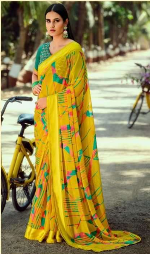
{ 1007 }