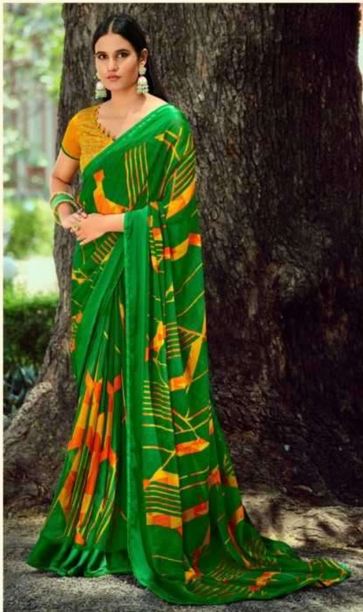
{ 1003 }