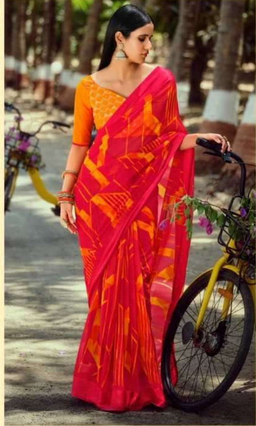
{ 1006 }