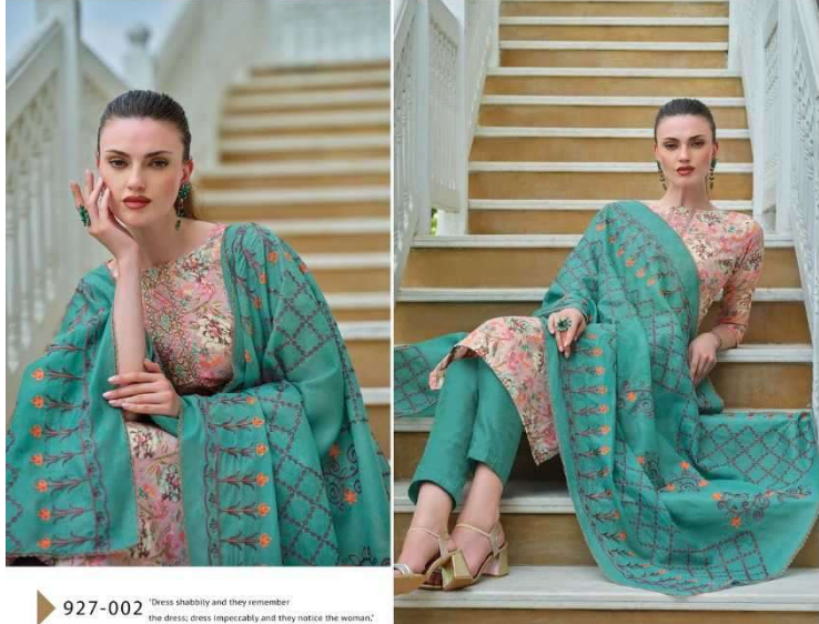
927-002 "Dress shabbily and they remember; the dress, dress impeccably and they notice the woman."