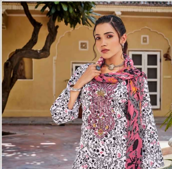
D.NO 6017 One is never over-dressed or under-dressed with a Little Black Dress.