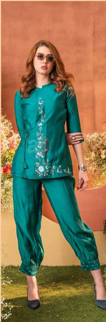
FUSION 3301 Vol.4