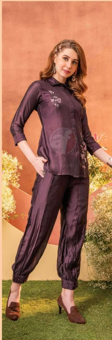
FUSION 3305 Vol4