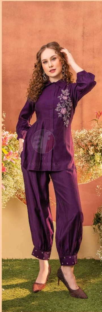
FUSION 3302 Vol.4