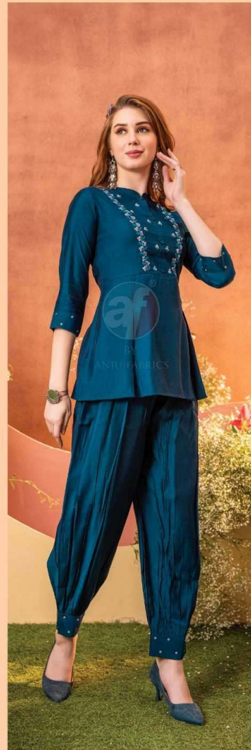
FUSION 3303 Vol.4