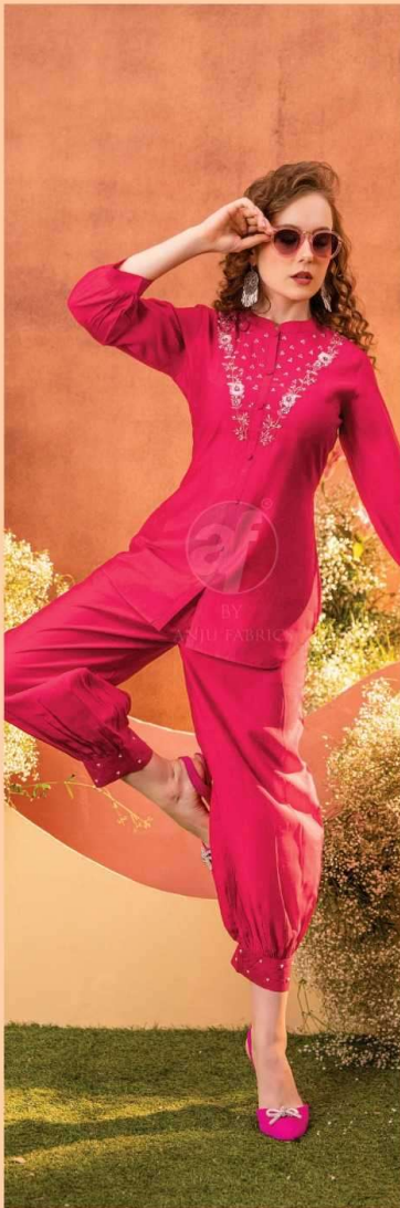
FUSION 3304 Vol4