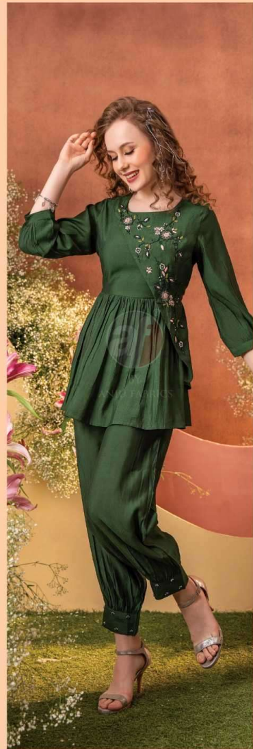
FUSION 3306 Vol4