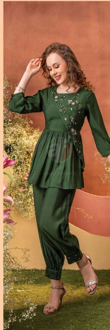
FUSION 3306 Vol4