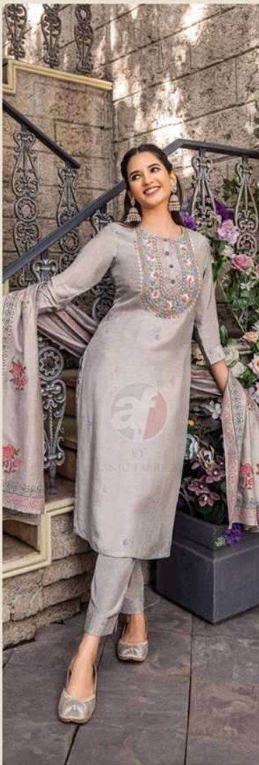
GOLDEN 3634 Meadows