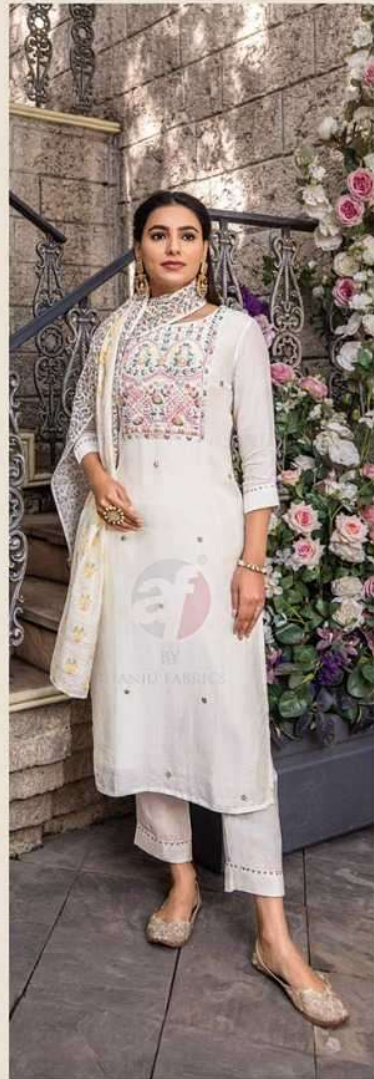
GOLDEN 3633 Meadows