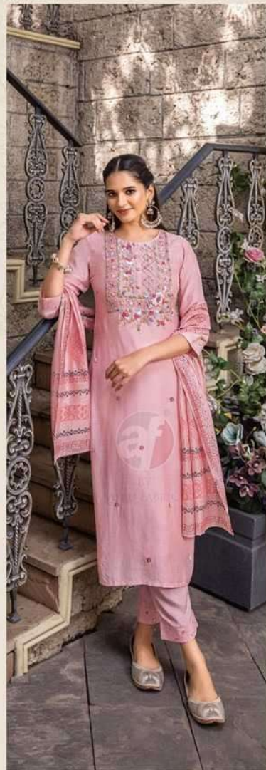
GOLDEN 3636 Meadows