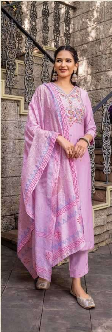
GOLDEN 3631 Meadows