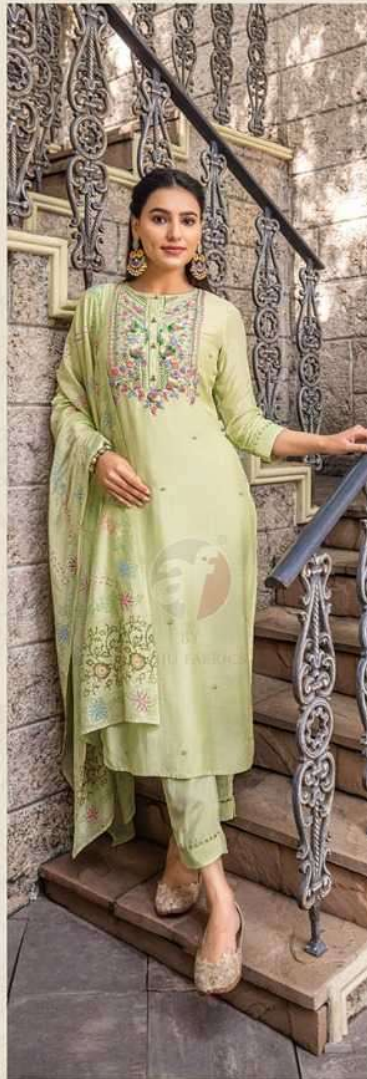
GOLDEN 3632 Meadows