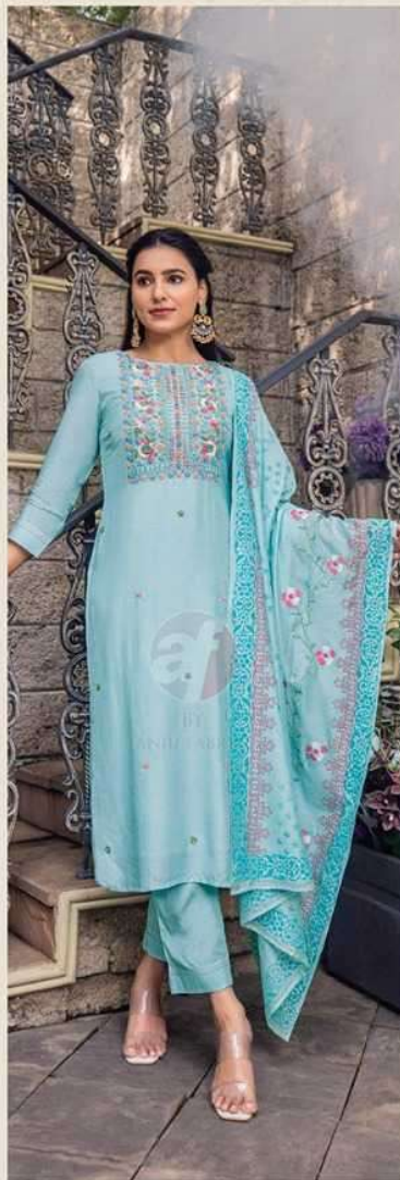
GOLDEN 3635 Meadows