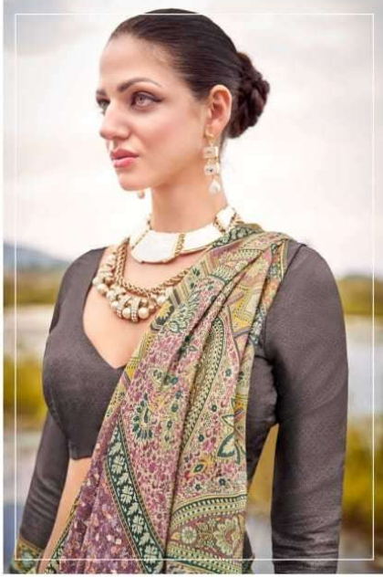
Classic to temporary- the contemporary designs with classy colors giving lustrous touch with finished heavy look.