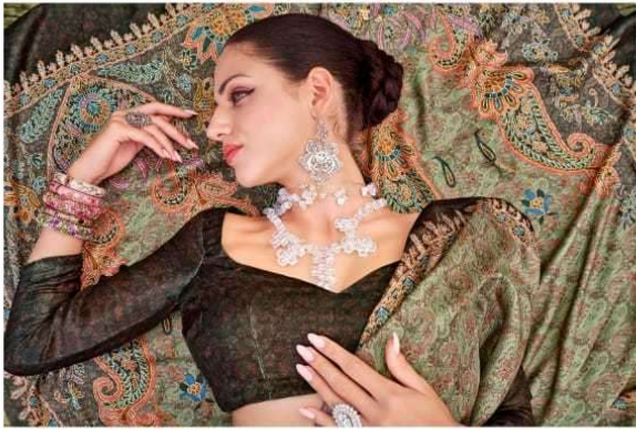
Classic to temporary- the contemporary designs with classy colors giving luscious touch with finished heavy look.