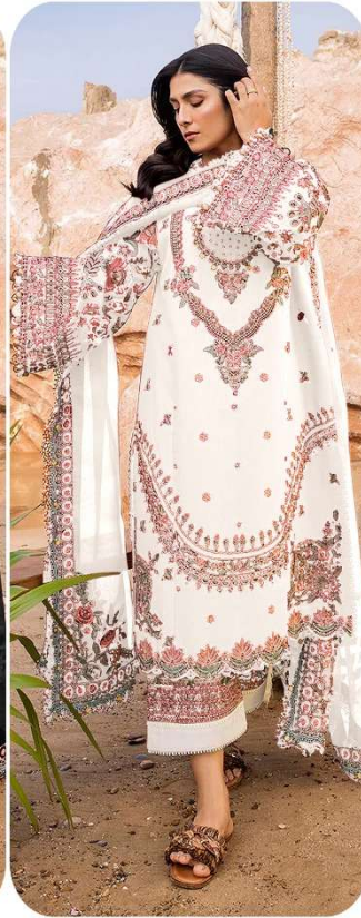
D.No | 266-C