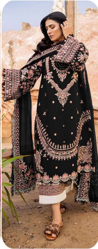
D.No | 266-B