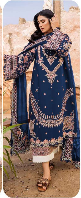
D.No | 266-D