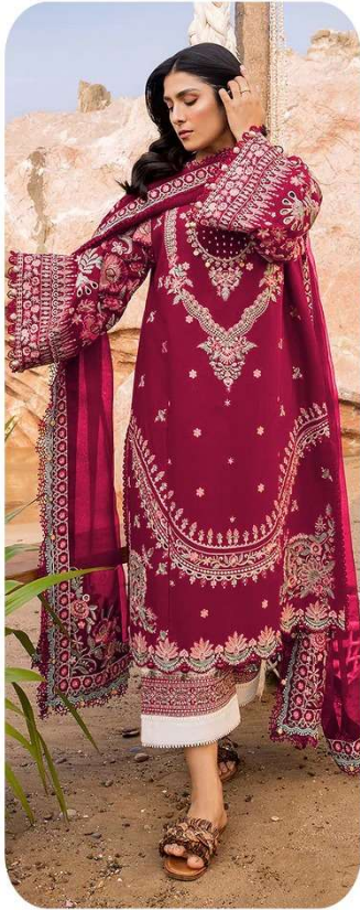
D.No | 266-A