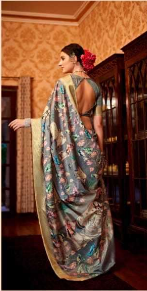
Fashion and looking more confident indian fashion beauty and culture as well as interviews with Trendsetters across the world of Style.