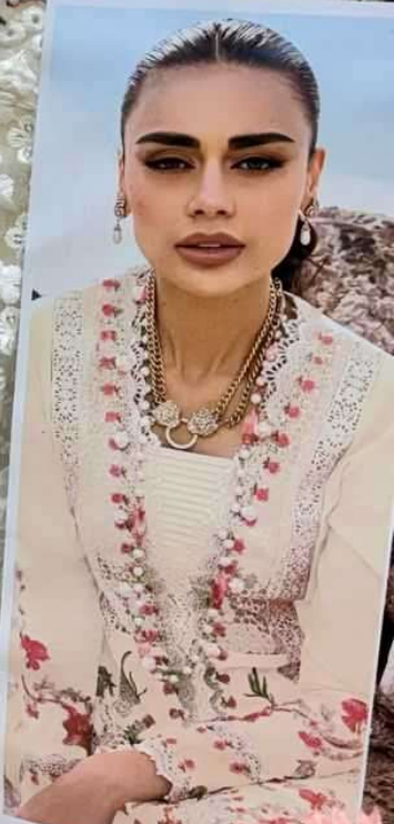
Noori Mirha TOP - Cambic Cotton With Heavy Embroidery