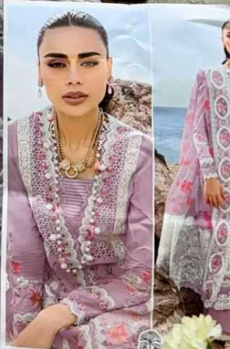
Noori Mirha ZAF TOP: Gambre Cotton With Heavy Embroidery Work BOTTOM: INNER Semi Lace