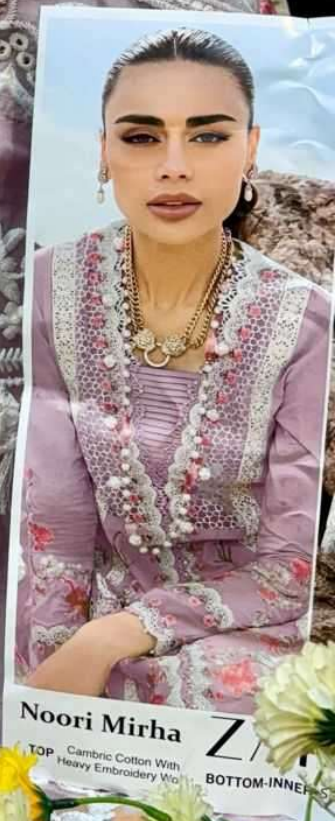
Noori Mirha TOP - Cambric Cotton With Heavy Embroidery W/... BOTTOM-INNE... Z... BOTTOM-INNE...