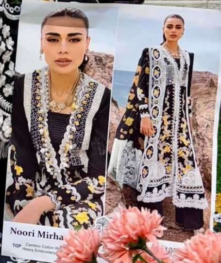
Noori Mirha TOP - Cambric Cotton With Heavy Embroidery