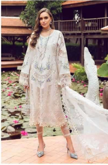
D.No | 263