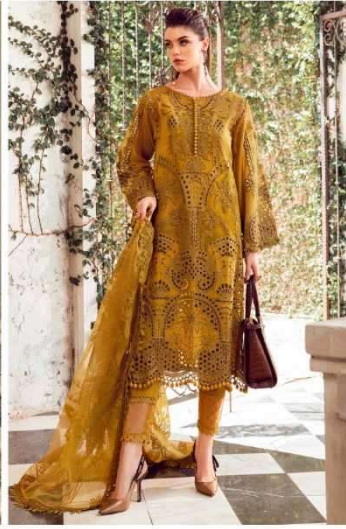
D.No | 265