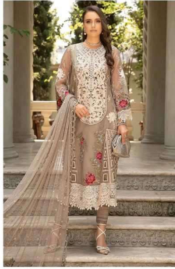
D.No | 264