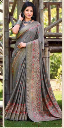
• 1006 •