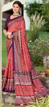
• 1009 •