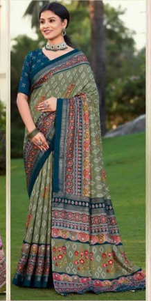
• 1012 •