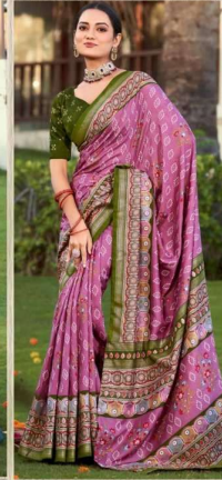
• 1011 •