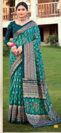
• 1010 •