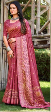
• 1001 •