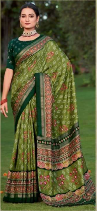
• 1007 •