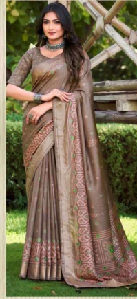
• 1004 •