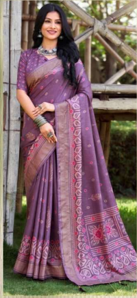
• 1002 •