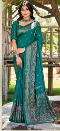
• 1003 •