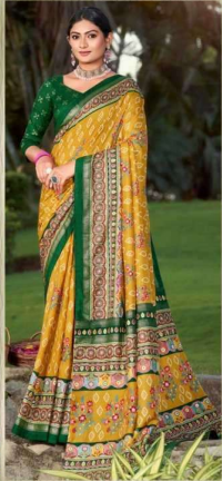
• 1008 •