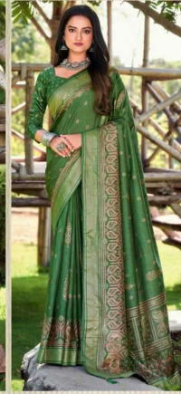
• 1005 •