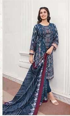
MUSAFIR - 3205