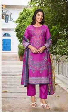
MUSAFIR - 3204