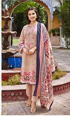
MUSAFIR - 3202