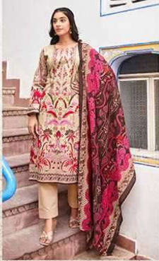
MUSAFIR - 3203