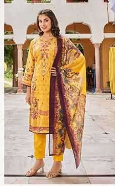
MUSAFIR - 3206