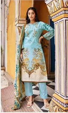
MUSAFIR - 3201