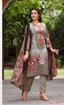
MUSAFIR - 3207