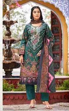
MUSAFIR - 3208