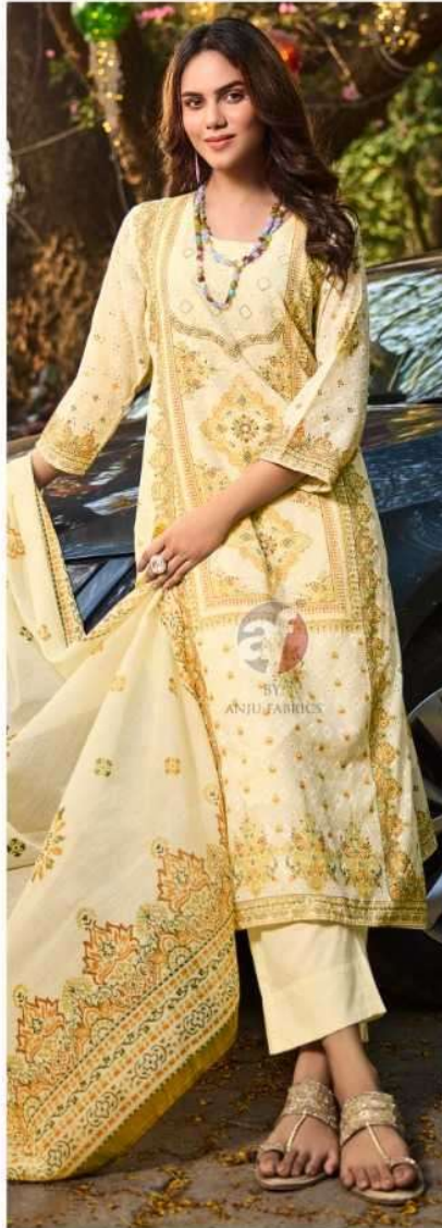
D.no.3725 Flairs VOL-3