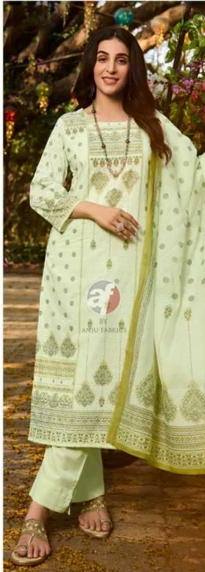
D.no.37522 Flairs VOL-3