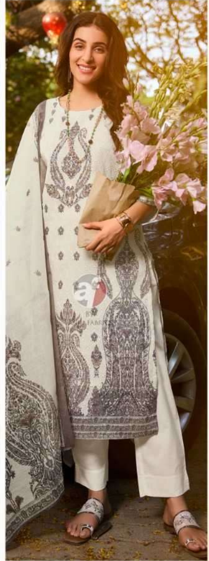
D.no.3723 Flairs VOL-3