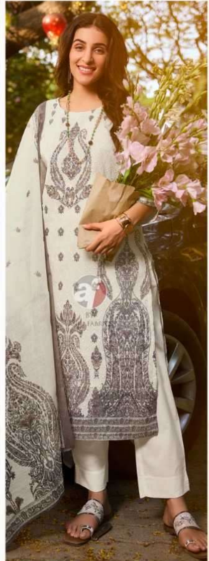
D.no.3723 Flairs VOL-3