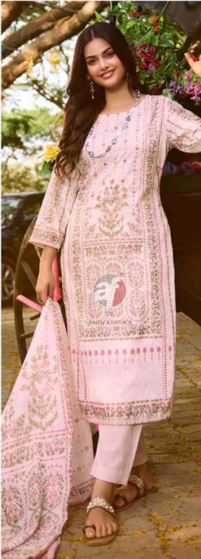
D.no.3724 Flairs VOL-3