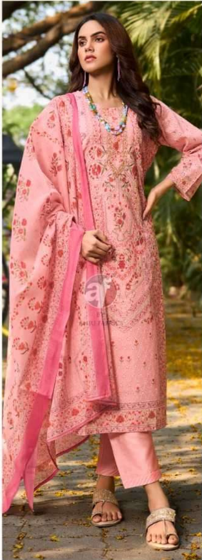
D.no.3721 Flairs VOL-3