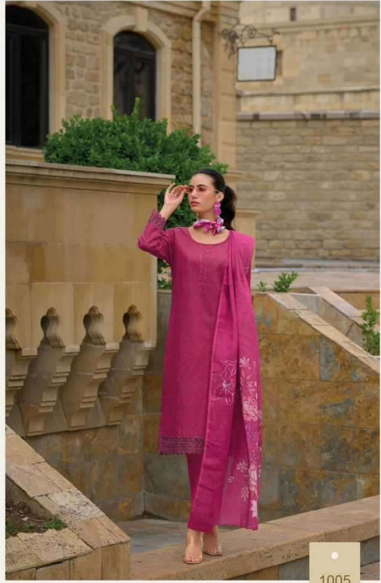
A girl should be two things: classy and fabulous