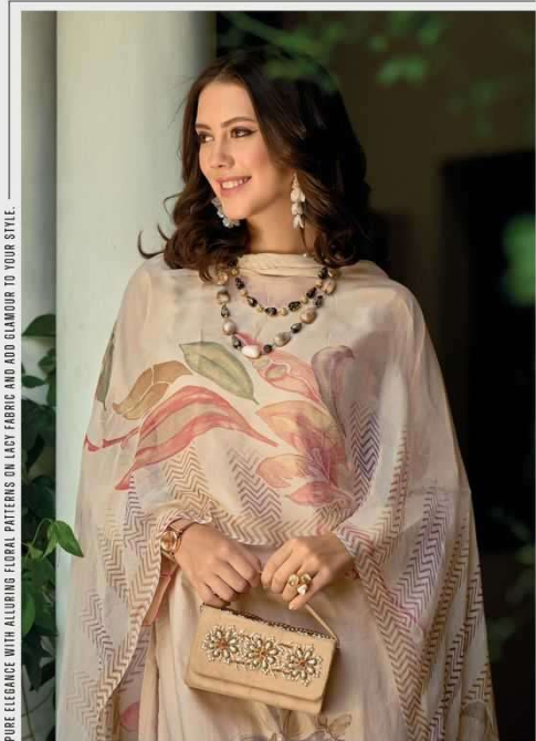
PURE ELEGANCE WITH ALLURING FLORAL PATTERNS ON LACY FABRIC ADD GLAMOUR TO YOUR STYLE.