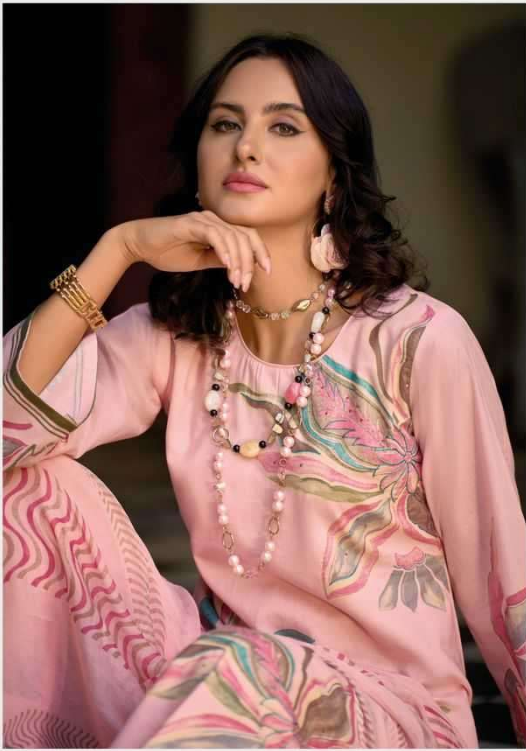
ROSHINA | 1034

PURE ELEGANCE WITH ALLURING GLOBAL PATTERNS ON LACY FABRIC AND ADD GLAMOUR TO YOUR STYLE