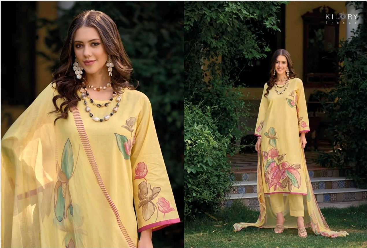
PURE ELEGANCE WITH ALLURING FLORAL PATTERNS ON LACY FABRIC AND ADD GLAMOUR TO YOUR STYLE