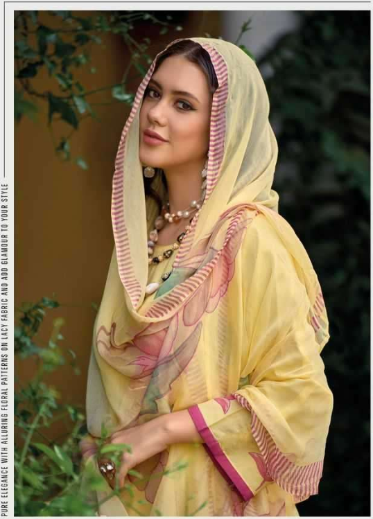
PURE ELEGANCE WITH ALLURING FLORAL PATTERNS ON LACY FABRIC AND ADD GLAMOUR TO YOUR STYLE