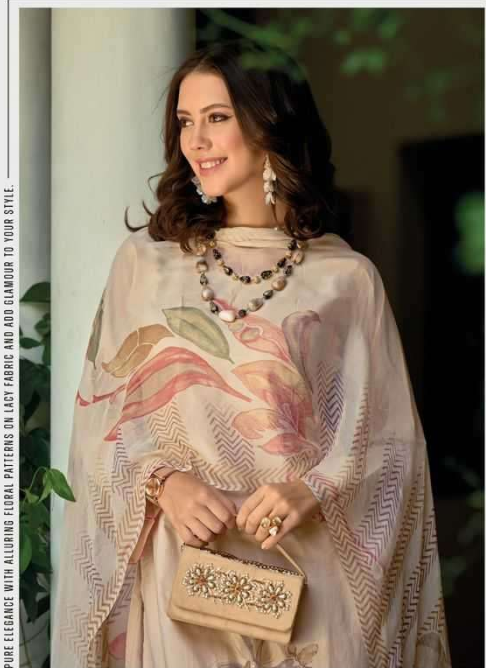
PURE ELEGANCE WITH ALLURING FLORAL PATTERNS ON LACY FABRIC ADD GLAMOUR TO YOUR STYLE.