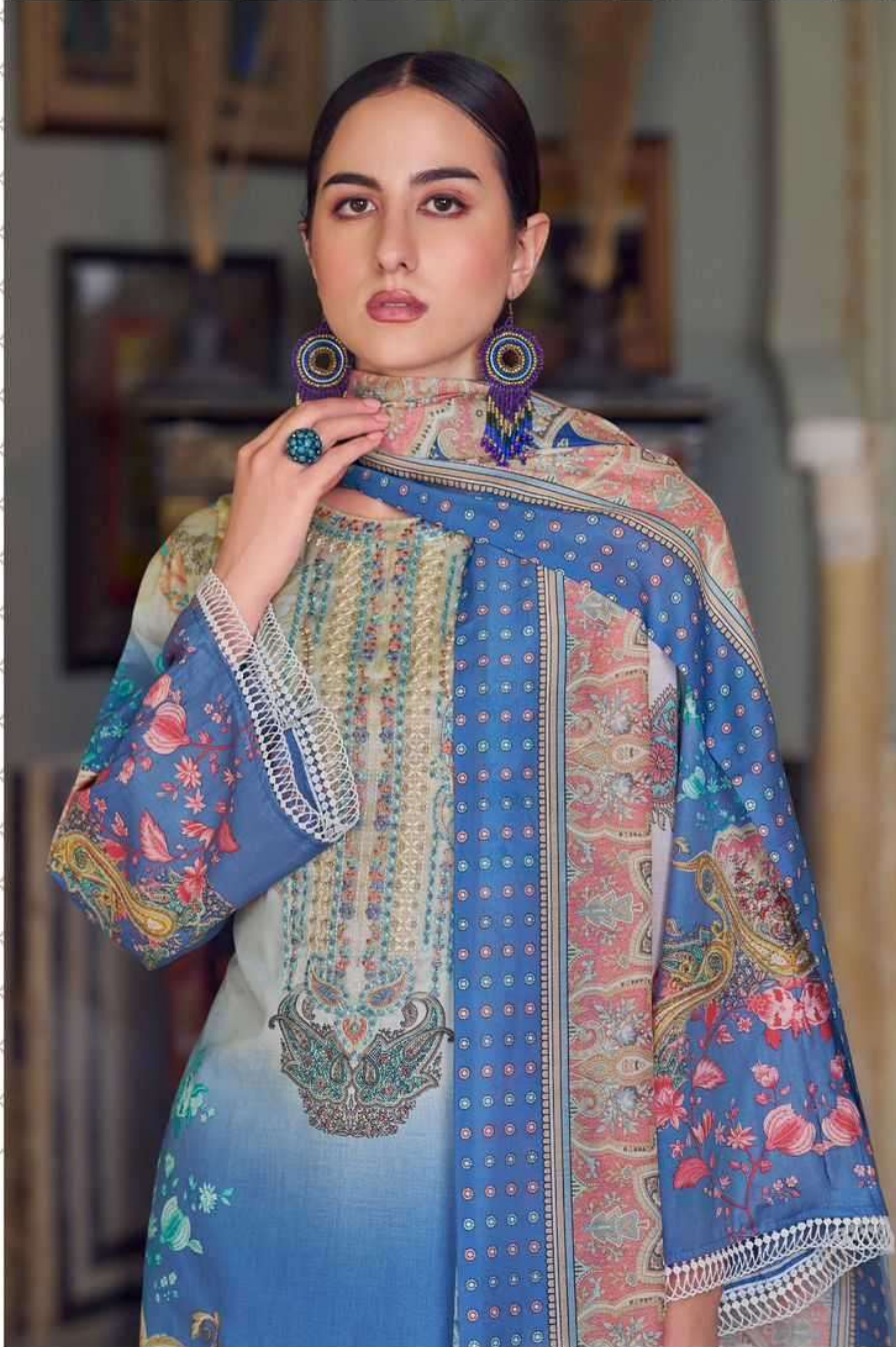
Classic styles with luxurious soft fabrics are highlighted by refined and feminine details