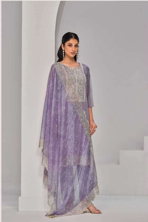
contemporary & classic find perfect balance in this season's return to playful and bright palette