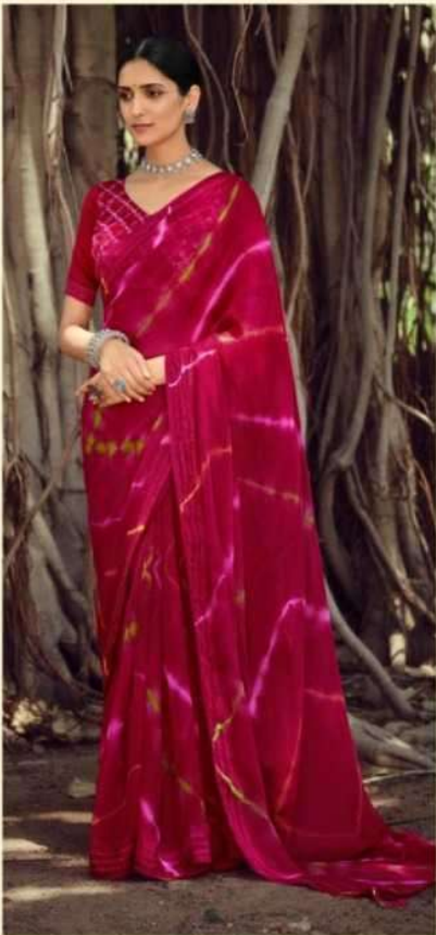
| 1005 |