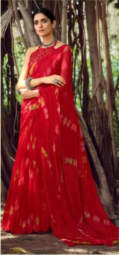
| 1001 |