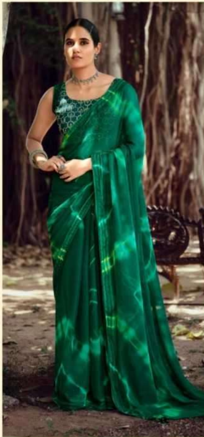
| 1006 |