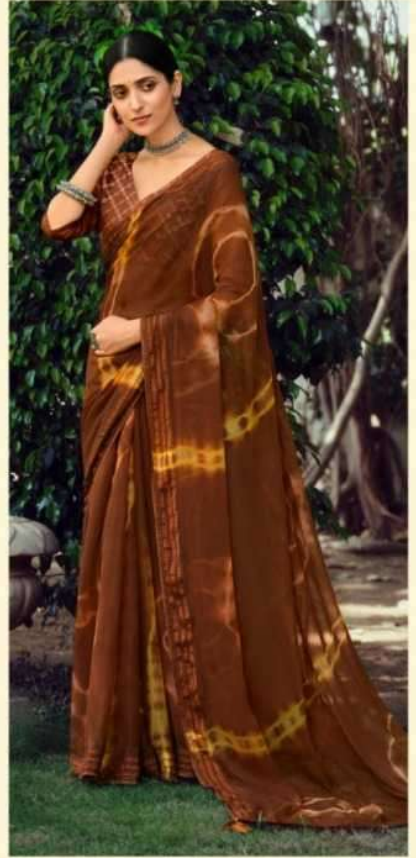
| 1003 |