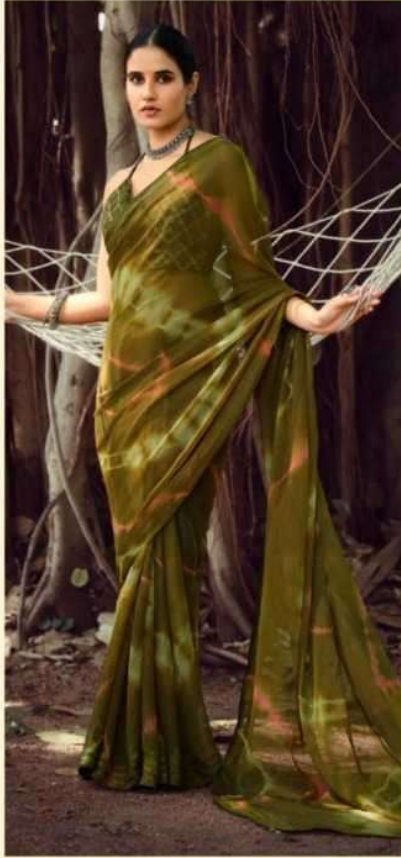
| 1002 |