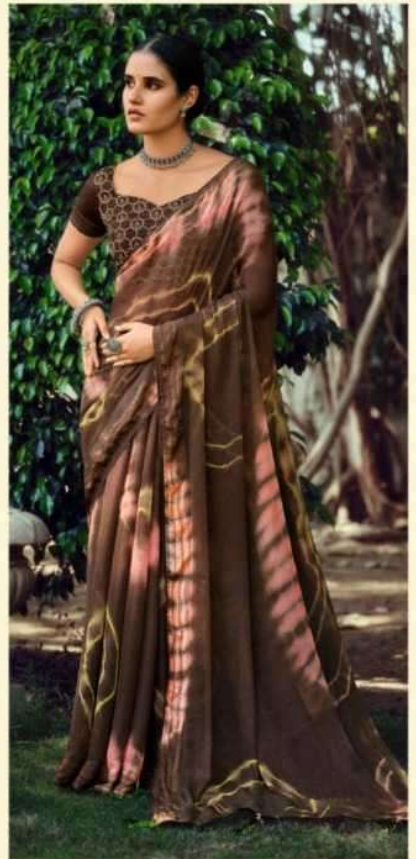
| 1007 |