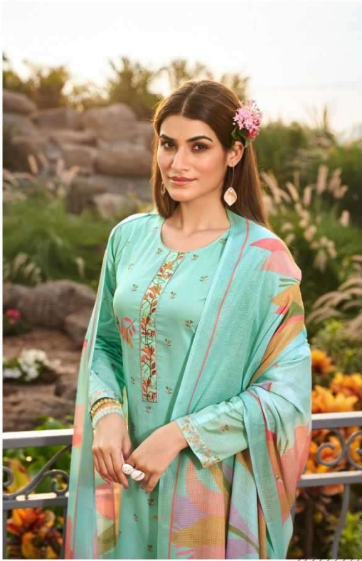
THE ESSENCE OF GREAT 1601-