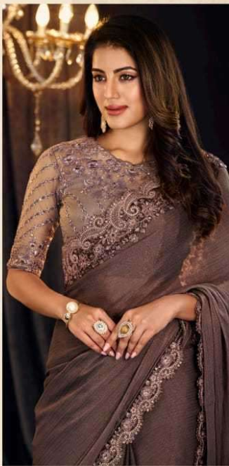
Design No. 13003