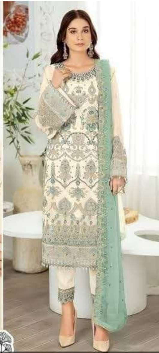
KHUSBOO .-ZAHA-10226 (A3135001) TOP Pure Georgette with Embroidery (Cut-2.5 Mtr.) BOTTOM-INNER Dull santoon (Cut-4.20 Mtr.) DUPATTA with Embroidery (Cut-2.5 Mtr.)