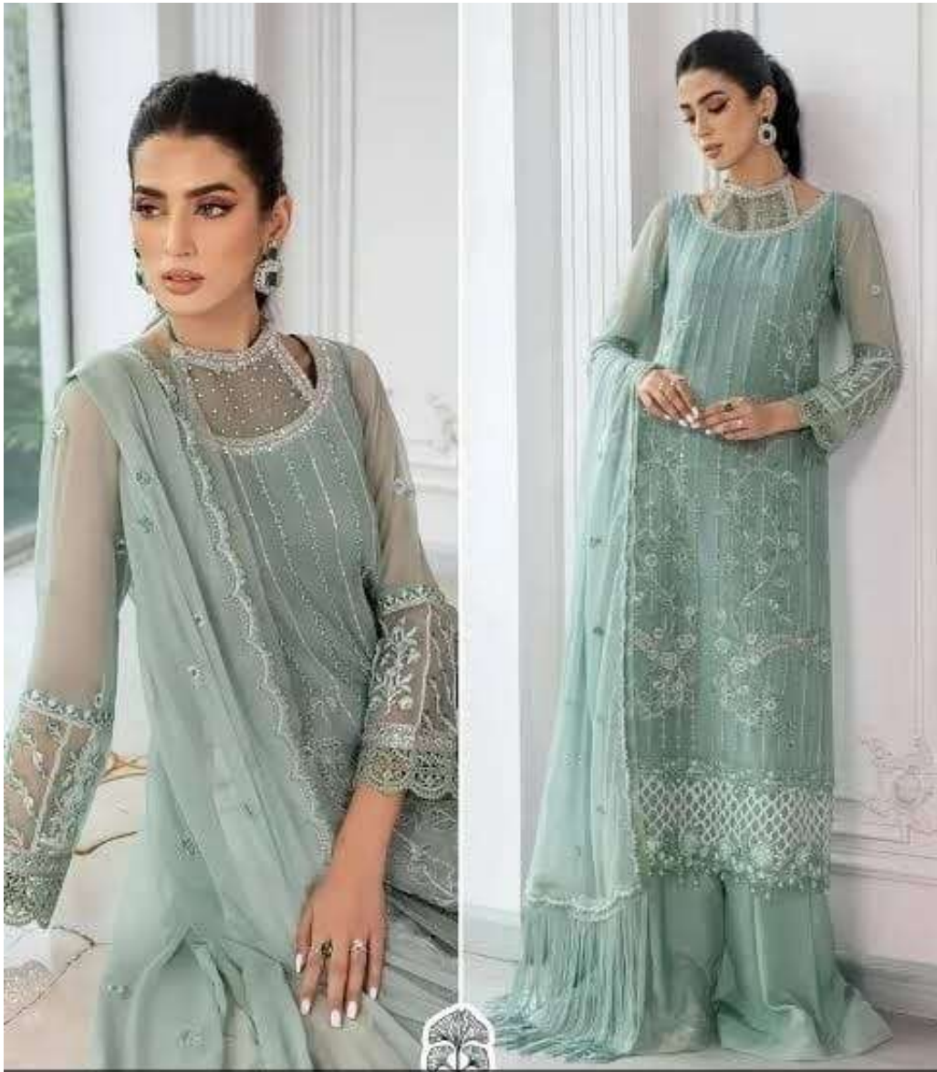
GULAAL ZAHRA DN-10260 .-ZAHA-10260 (A3137501) TOP Faux Georgette with Embroidery BOTTOM-INNER Duli Santoon DUPATTA Naznun with Embroidery