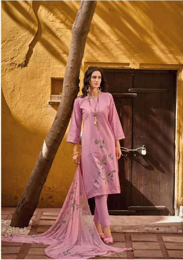
Dress shabbily and they remember the dress; dress impeccably and they notice the woman 998