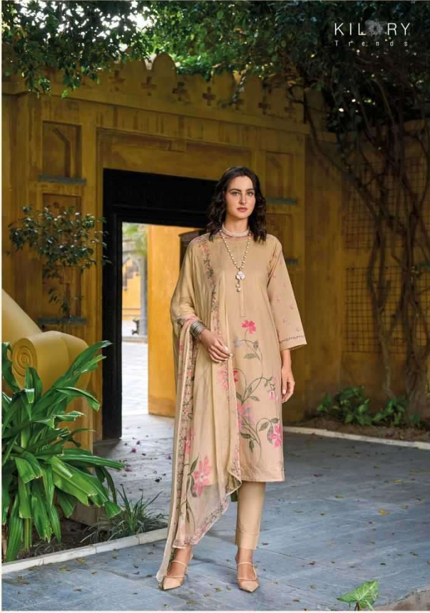
Playing dress-up begins at age five and never truly ends //////////////////////////////////////////////////////////////////// 991