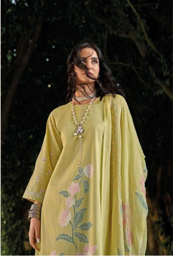
Elegance is not standing out, but being remembered //////////////////////////////////////////////////////////////////