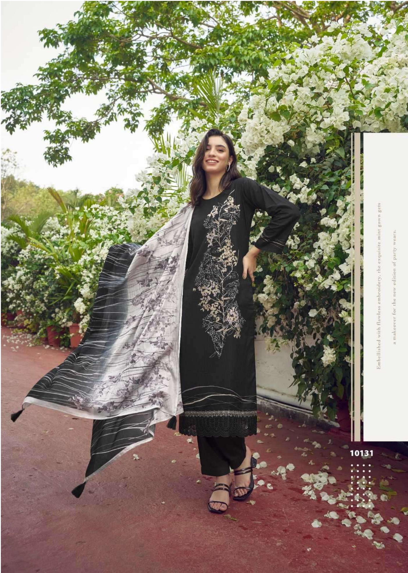
Embellished with flawless embroidery, the exquisite mint gown gets a makeover for the new edition of party wears.