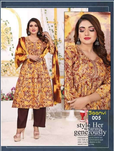
Saanvi 005 style Her with generously