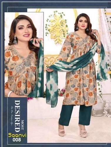
DESIRE MOST Saanvi 008