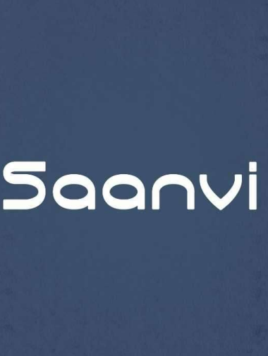
DESIRE MOST Saanvi 008