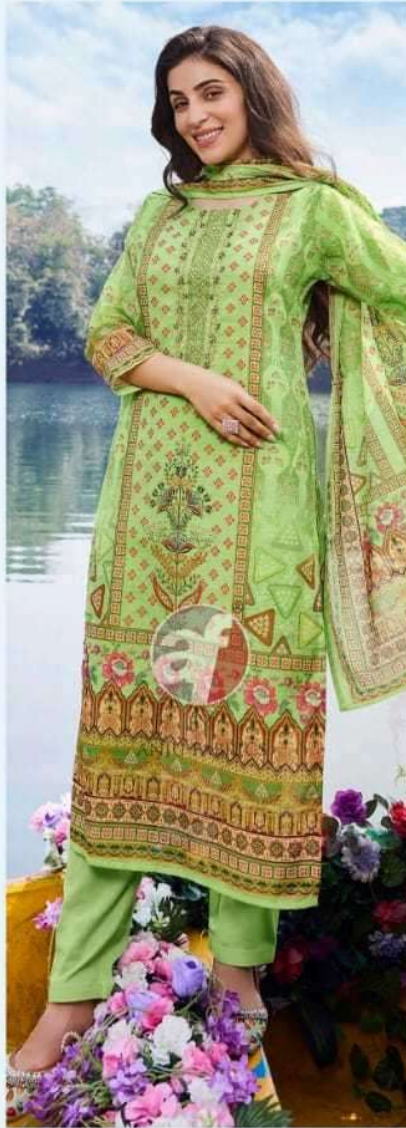
Pretty Petals VOL-2 D.no.3762