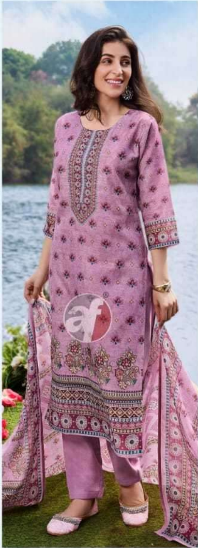
Pretty Petals VOL-2 D.no.3761