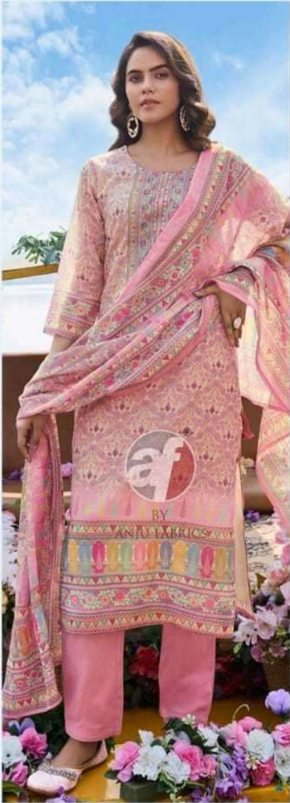
Pretty Petals VOL-2 D.no.3764