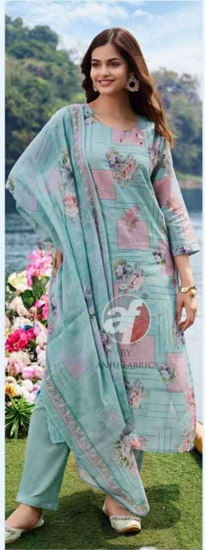
Pretty Petals VOL-2 D.no.3766