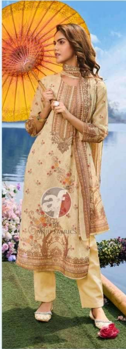
Pretty Petals VOL-2 D.no.3765