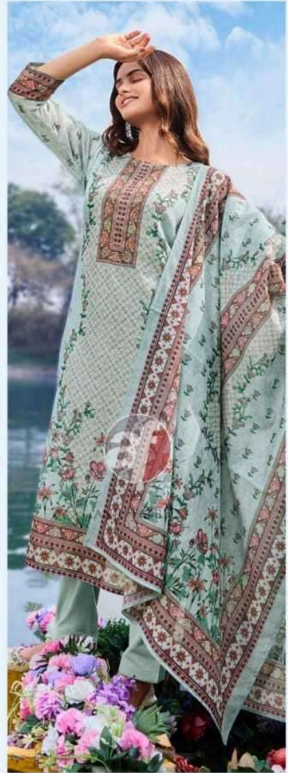
Pretty Petals VOL-2 D.no.3763