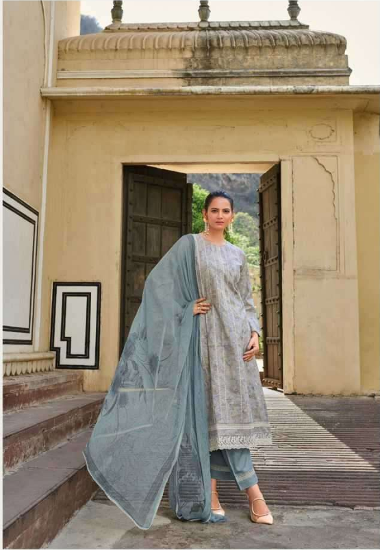
KILORY || 1025