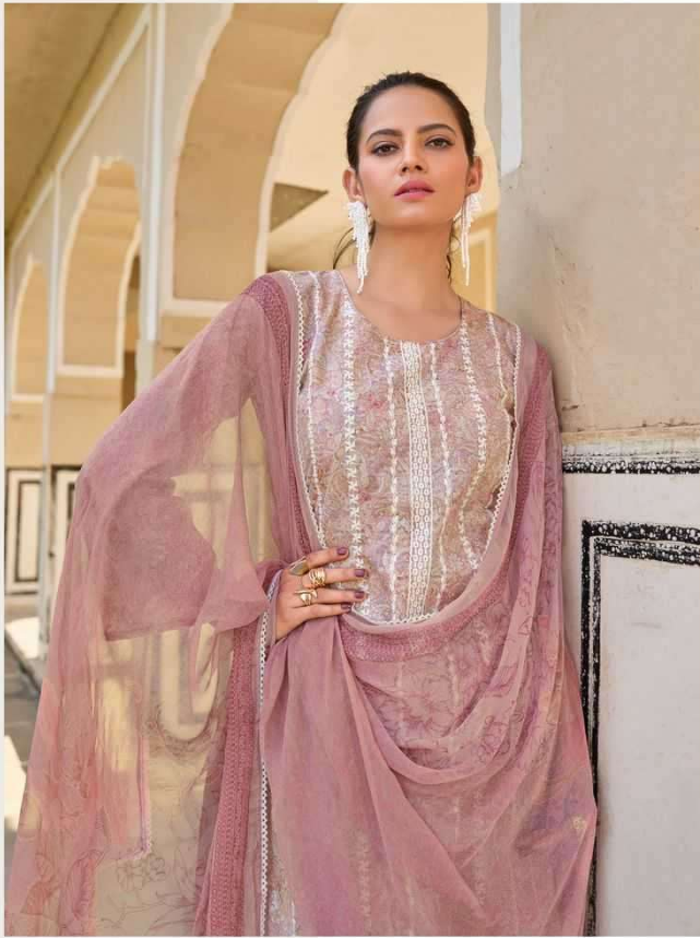
KILORY || 1024