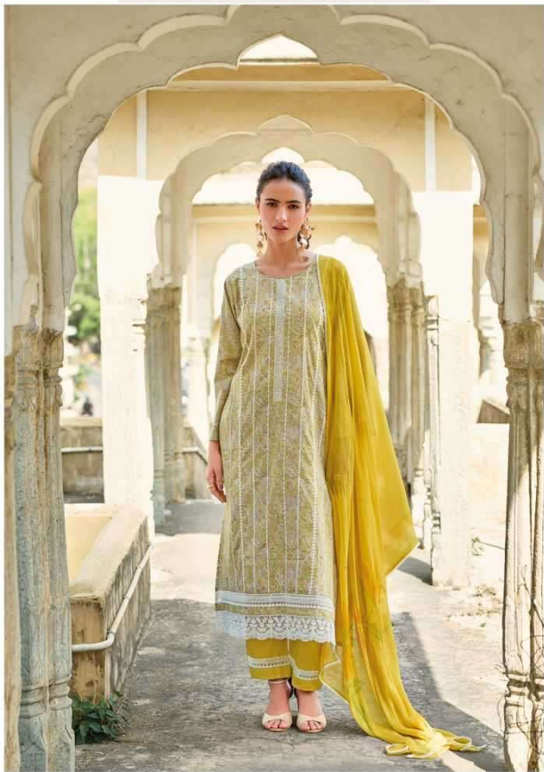
KILORY || 1022