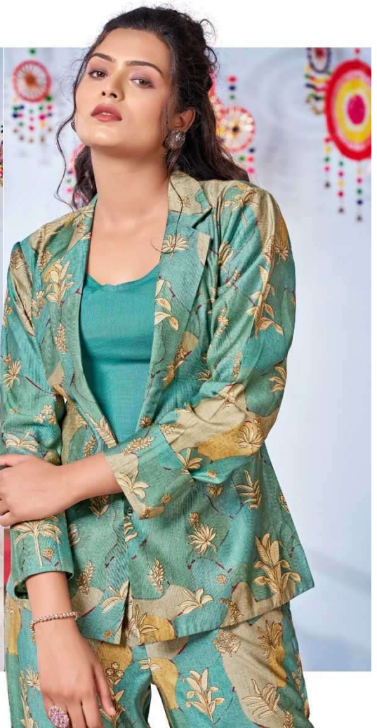
The right attitude and dignity you look with graceful ethnicity and enchanting femininity. 1002-B