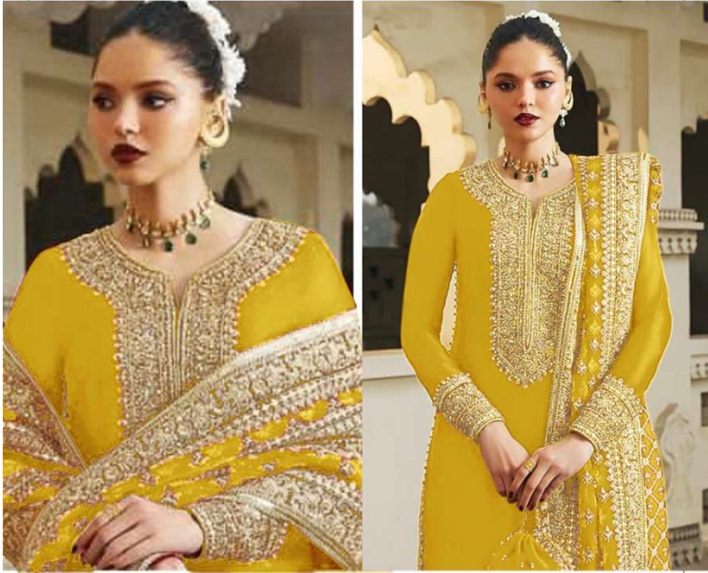
TOP - PURE FOX GEORGETTE WITH HEAVY EMBROIDERY AND SEQUENCE WORK BOTTOM - SANTOON DUPATTA - PURE FOX GEORGETTE FANCY DUPATTA AND EMBROIDERY WORK