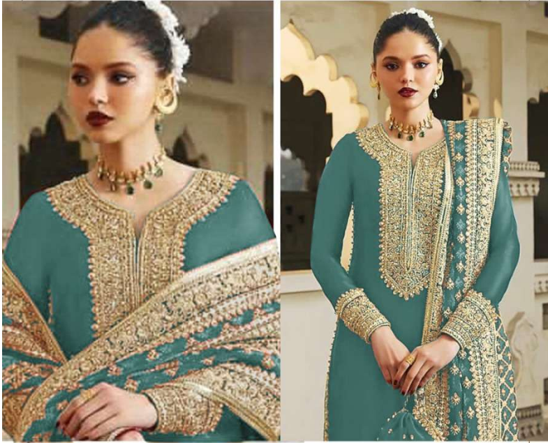
TOP - PURE FOX GEORGETTE WITH HEAVY EMBROIDERY AND SEQUENCE WORK BOTTOM - SANTOON DUPATTA - PURE FOX GEORGETTE FANCY DUPATTA AND EMBROIDERY WORK