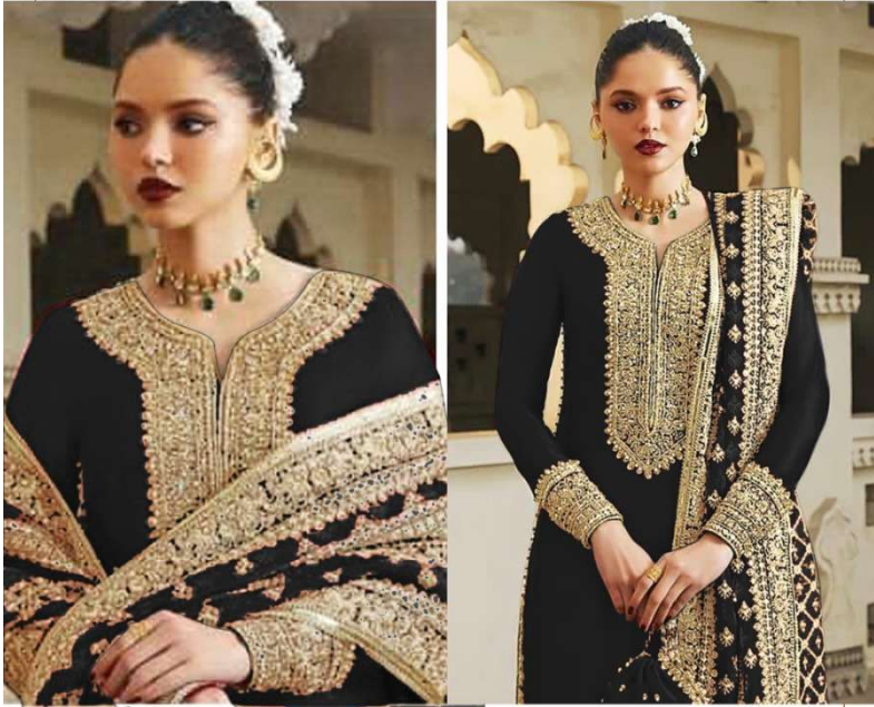
TOP - PURE FOX GEORGETTE WITH HEAVY EMBROIDERY AND SEQUENCE WORK BOTTOM - SANTOON DUPATTA - PURE FOX GEORGETTE FANCY DUPATTA AND EMBROIDERY WORK