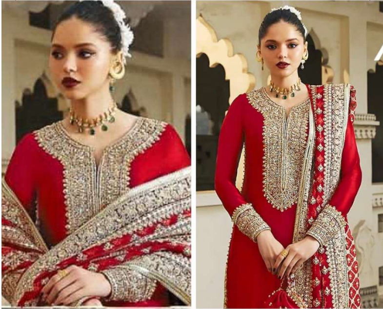
TOP - PURE FOX GEORGETTE WITH HEAVY EMBROIDERY AND SEQUENCE WORK BOTTOM - SANTOON DUPATTA - PURE FOX GEORGETTE FANCY DUPATTA AND EMBROIDERY WORK