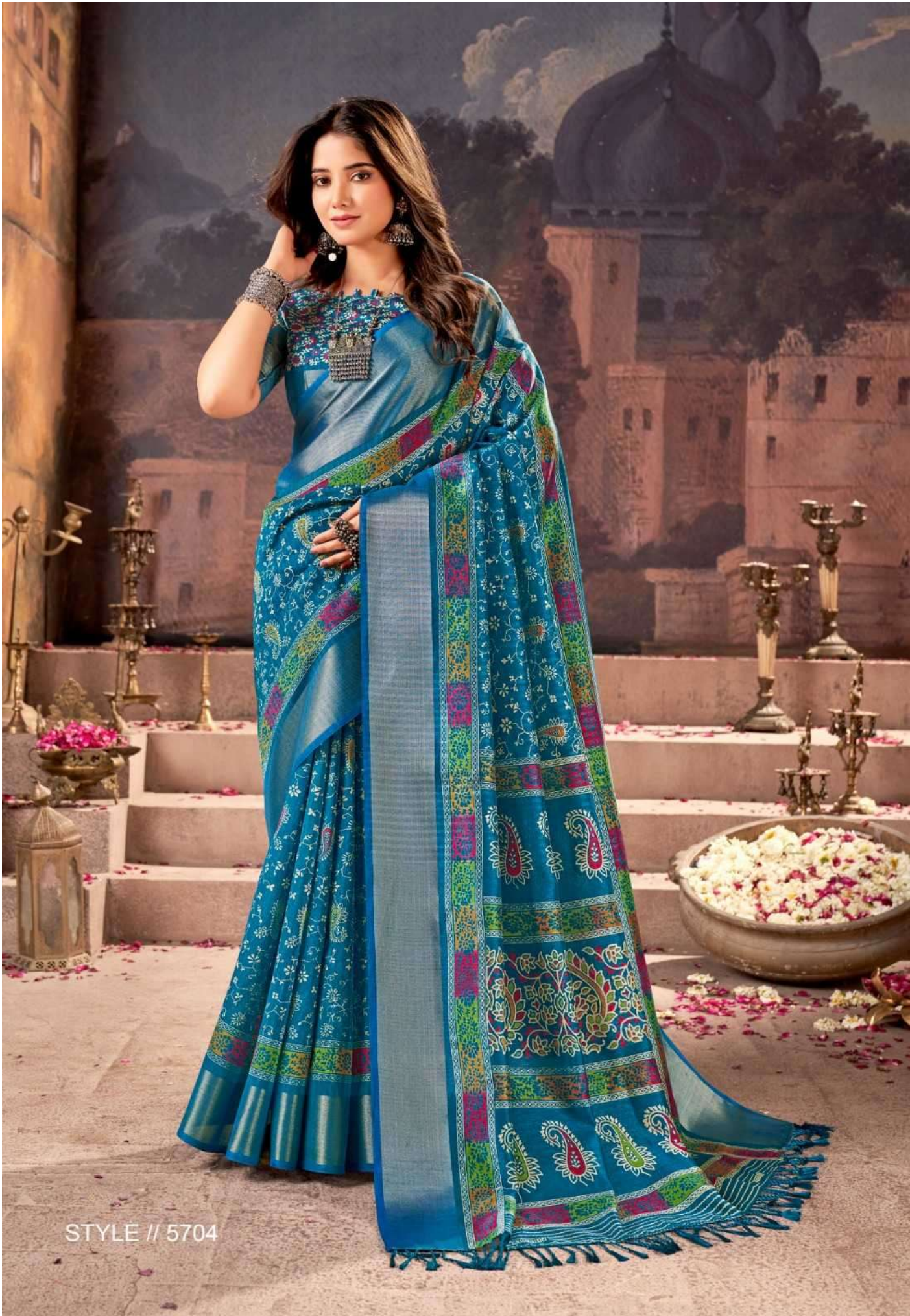
STYLE // 5704