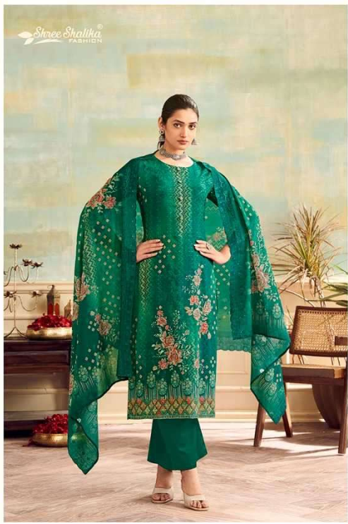
EMBRACE ONE OF THE PUREST TRENDS THIS SEASON CODE#4006