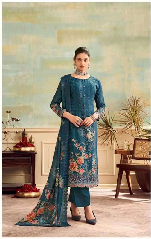
TRADITIONAL HUE GETS A WHOLE NEW LOOK CODE#4002