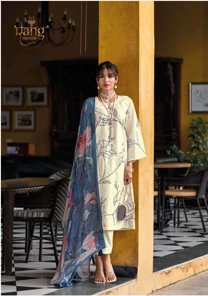
ENIGMATIC FASCINATE CODE || 1002