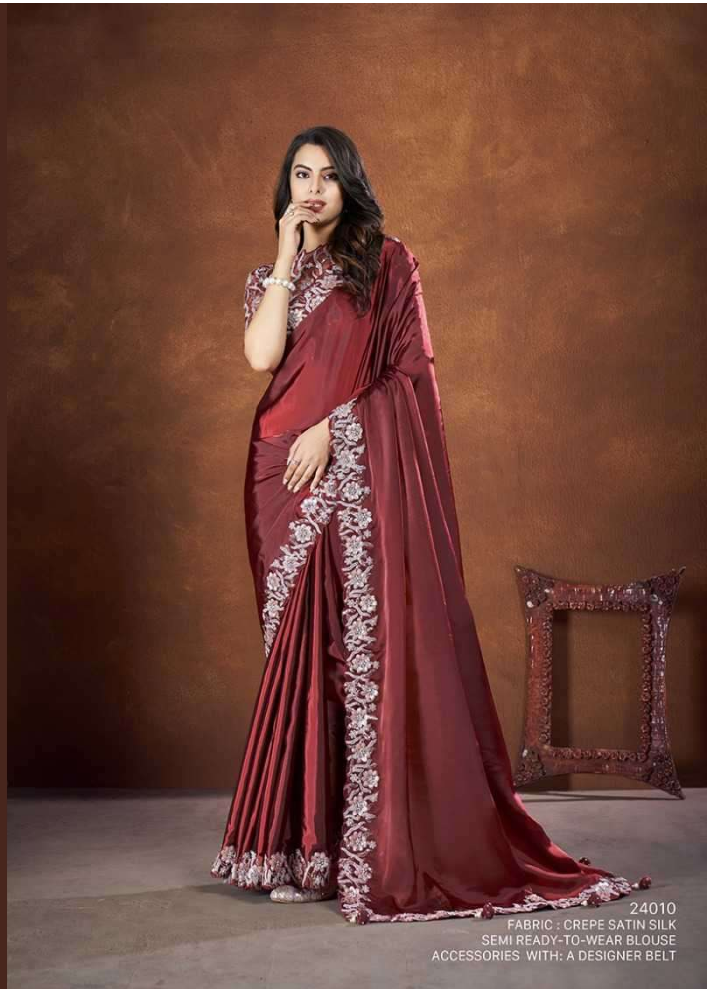
24010 FABRIC : CREPE SATIN SILK SEMI READY-TO-WEAR BLOUSE ACCESSORIES WITH: A DESIGNER BELT