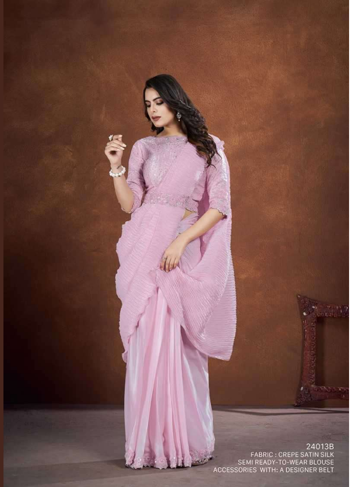
24013B FABRIC : CREPE SATIN SILK SEMI READY-TO-WEAR BLOUSE ACCESSORIES WITH: A DESIGNER BELT