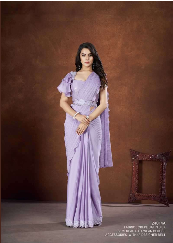
24014A FABRIC : CREPE SATIN SILK SEMI READY-TO-WEAR BLOUSE ACCESSORIES WITH: A DESIGNER BELT