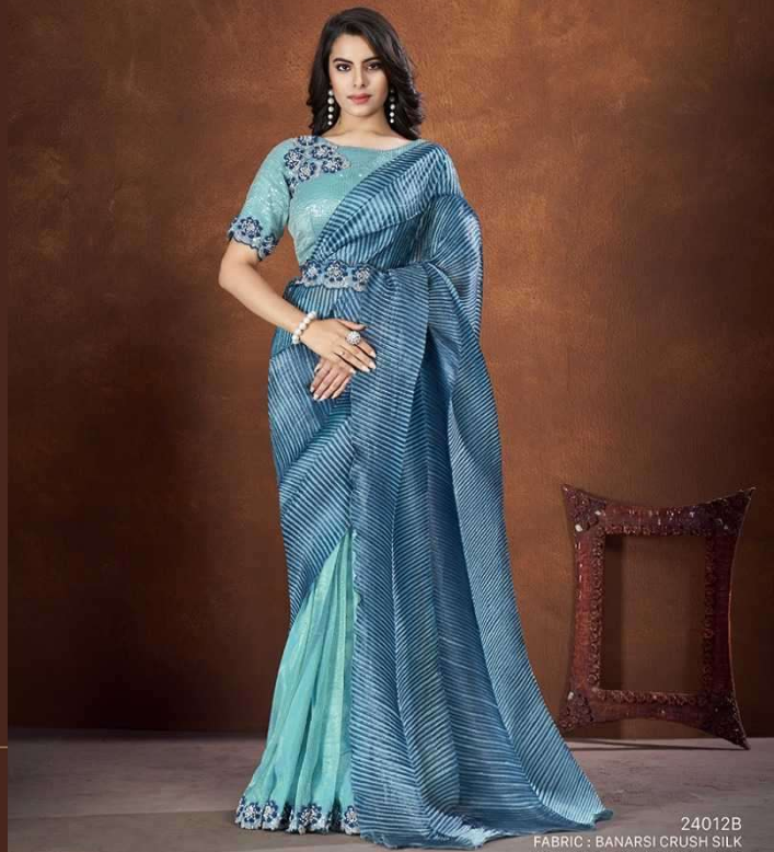
24012B FABRIC : BANARSI CRUSH SILK SEMI READY-TO-WEAR BLOUSE ACCESSORIES WITH: A DESIGNER BELT