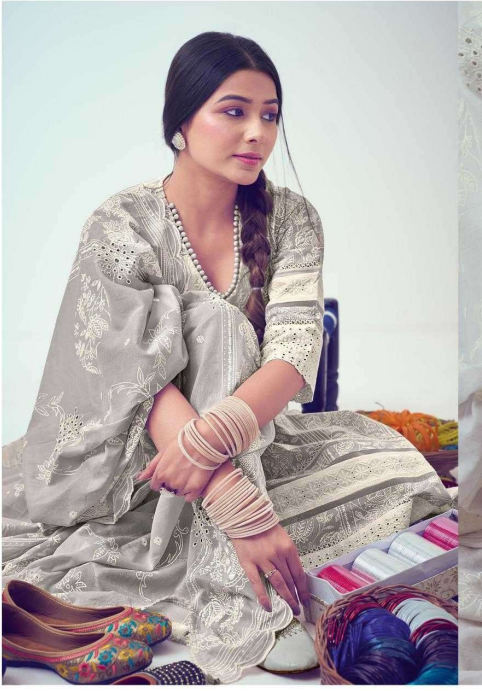
THE NEW AGE STYLE CALLS FOR A CHANGE IN TREND. DITCH HEAVY EMBROIDERY FOR SPECTACULAR PRINTS ON THE LIGHTER-THAN-AIR DRESS.